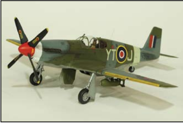
Barrie Flatman's Trumpeter 1-32 Mustang III