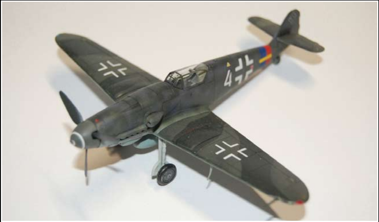
Sexy REVELL 109-G10 in 1/72 by Mike Rather