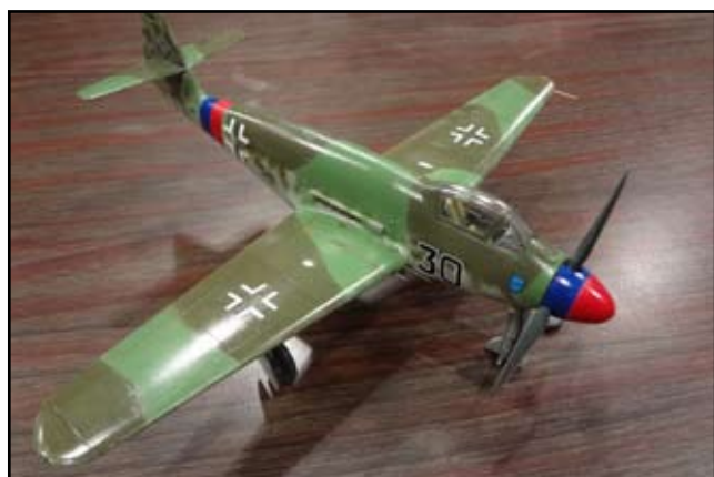
Trumpeter 1/48 Me509 by Brett Peacock