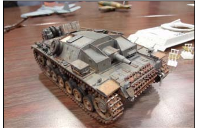
1/35 STUG by Gary Young