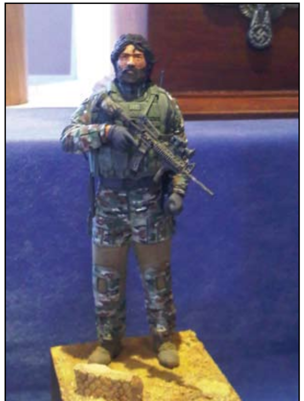
Scratchbuilt Willie Apiata VC