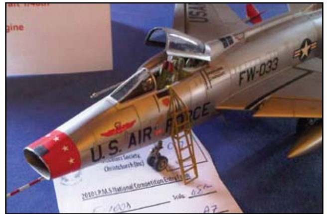
Best Aircraft - Monogram 1/48 F-100D by Glynn Braithwaite