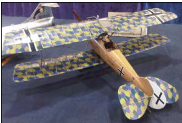
Wingnut Wings' new 1/32 Roland D.VIA