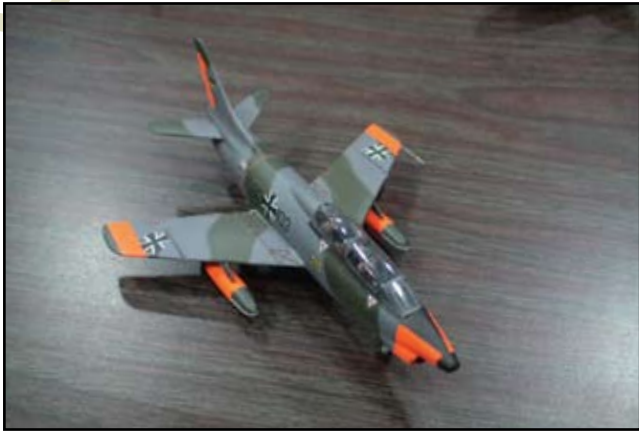
Aeroclub 1/72 Fiat G91-T by Henry Ludlam