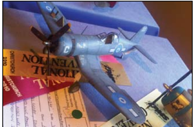
Best Prop, Single Engine, 1/48 by Brett Sharman - Gold