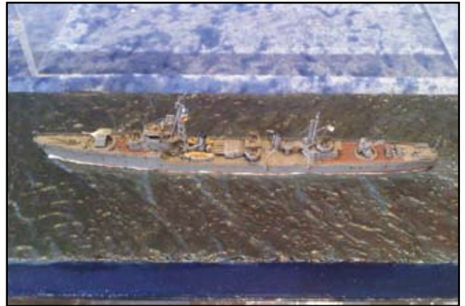
Best Ship - 1/700 IJNS Sakura (and some serious competition for Pete Randall)