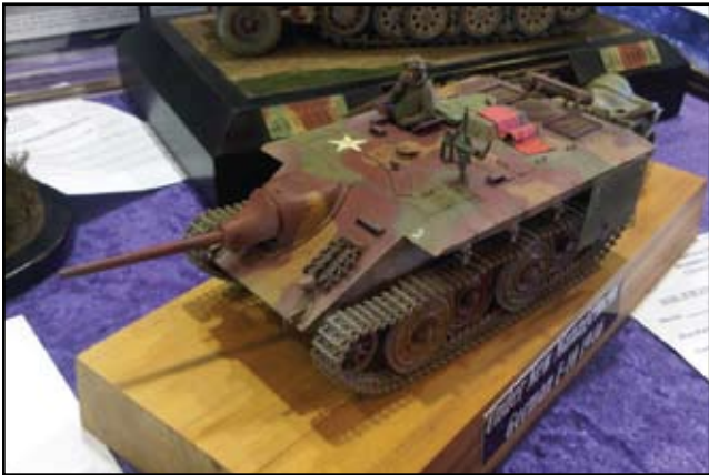
Best Armour - 1/35 Trumpeter E10 by Les Smith