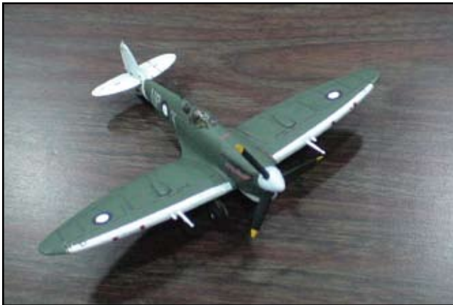
Airfix 1/72 Spitfire Vc by Henry Ludlam