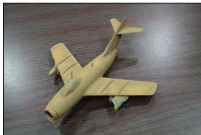
Airfix 1/72 MiG-15 by Peter Foxley