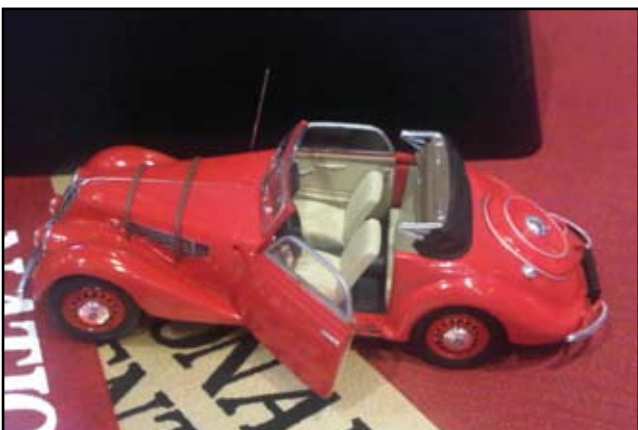
Best Vehicle - Hasegawa 1/48 BMW327