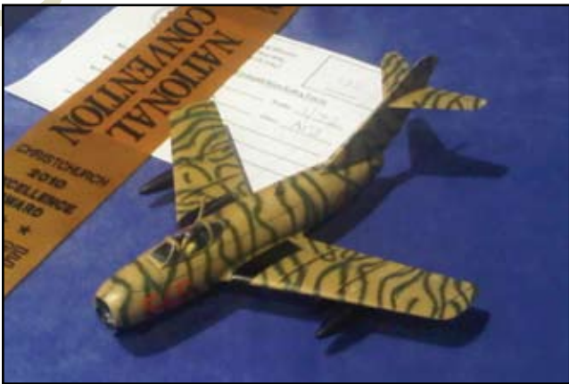
Airfix 1/72 MiG-15 by Pete Harrison - Bronze