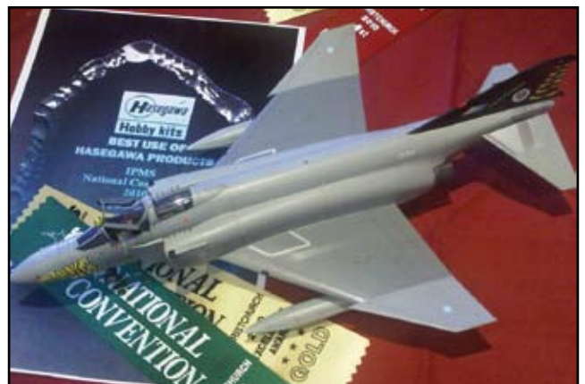
Best Use of Hasegawa Product - 1/48 RAF Phantom