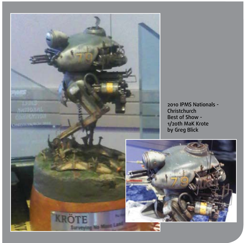
2010 IPMS Nationals - Christchurch Best of Show - 1/20th MaK Krote by Greg Blick