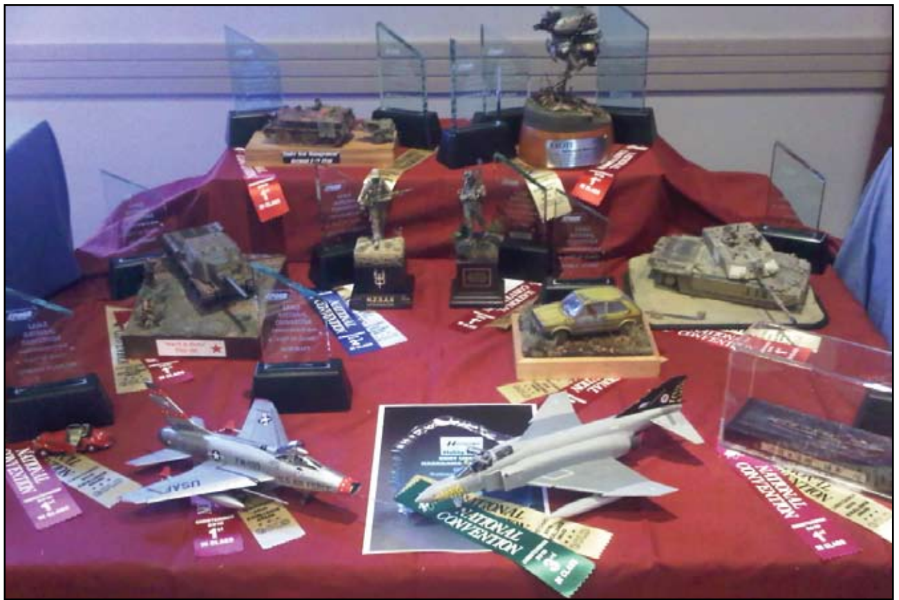
Best in class and show winners and trophies on the table at the end of the show