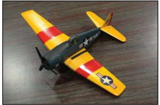
Heller 1/72 F6F-5K Hellcat by Dimitri Berdebes