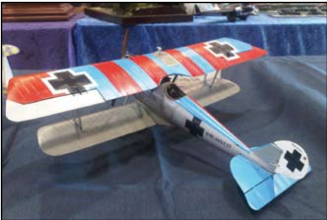
Wingnut Wings' new 1/32 Pfalz D.IIIA