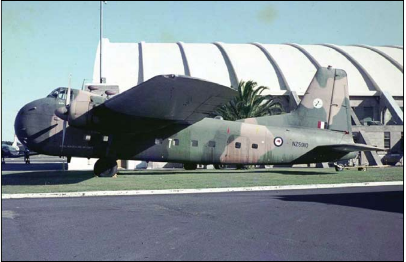
RNZAF Bristol Freighter

This interesting shot was taken at an air show at Whenuapai about 1976. The Freighters were being retired and replaced by Andovers one of which can be seen in the background. I understand that this one was one of those which had been stationed in Singapore hence the map of New Zealand on the tail. This was very rare perhaps carried by only two aircraft. Note the small Royal New Zealand Air Force lettering at the bottom of the nose. Also of interest is the towing attachment on the tail wheel.