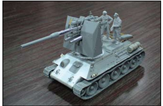
Dragon 1/35 T-34/Flak 37 by Gary Boxall