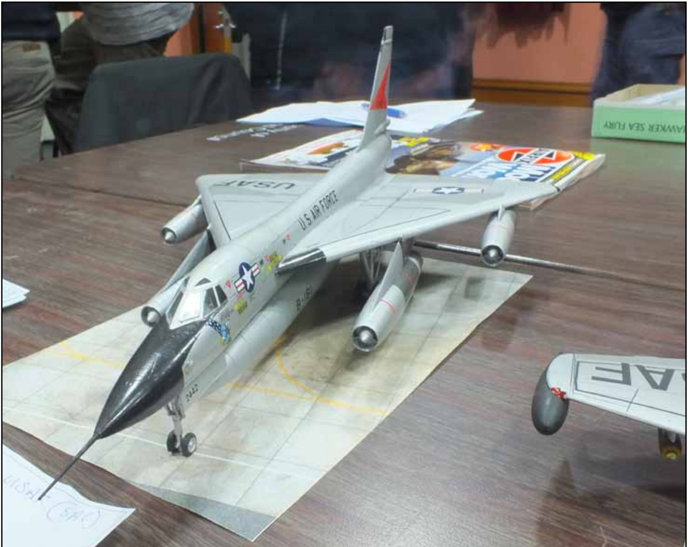
Below: 1/72 Italeri B-58 Hustler SAC