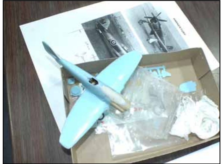
Above: 1/72 Hawker Fury to be converted to.... a Fury with a face only a mother could love below....