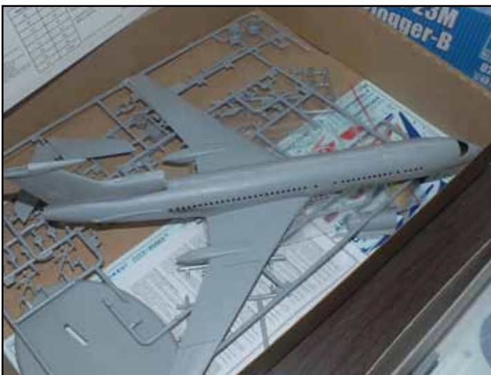
Above: 1/144 Zvezda Tu-154M