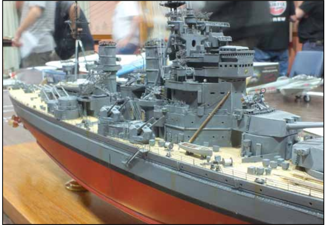
Right and below: 1/350 HMS King George V