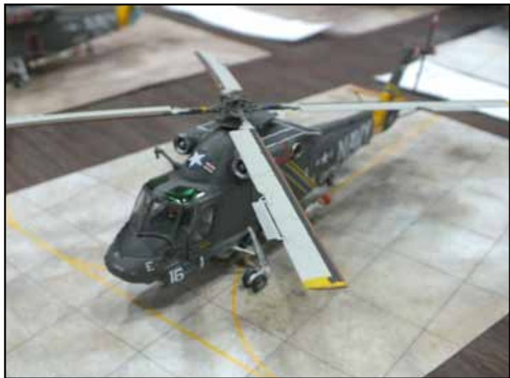
Above: 1/72 Airfix Kaman Sea Sprite