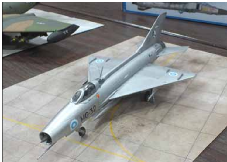
Above: 1/72 Revell Mig-21F Finnish AF