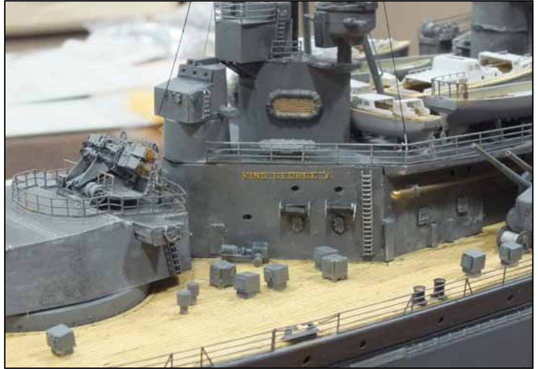
Right and below: 1/350 HMS King George V