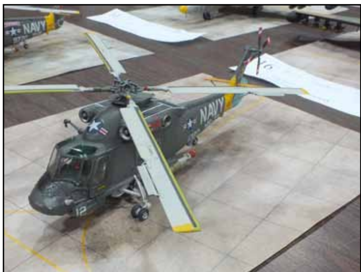
Above: 1/72 Kaman Sea Sprite