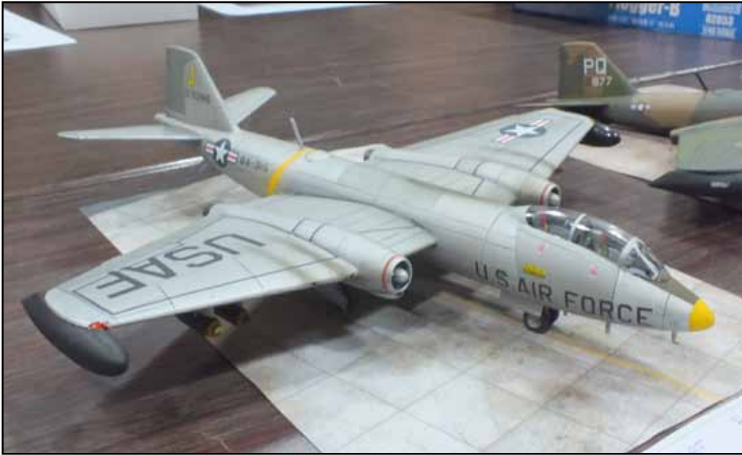
Left: 1/72 Italeri B-57 Canberra