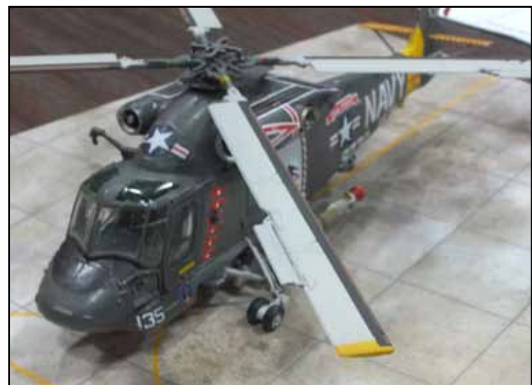
Above: 1/48 Classic Airframes Curtiss P-6E Hawk