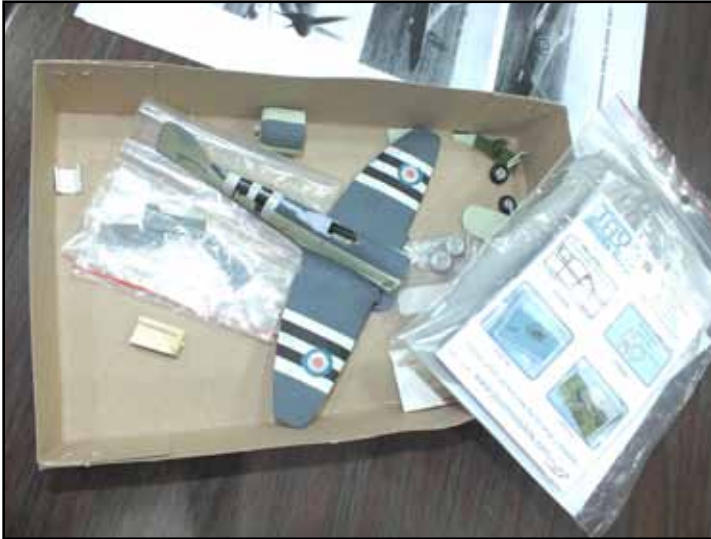
Above: 1/72 Hawker Fury to be converted to LA610 below...