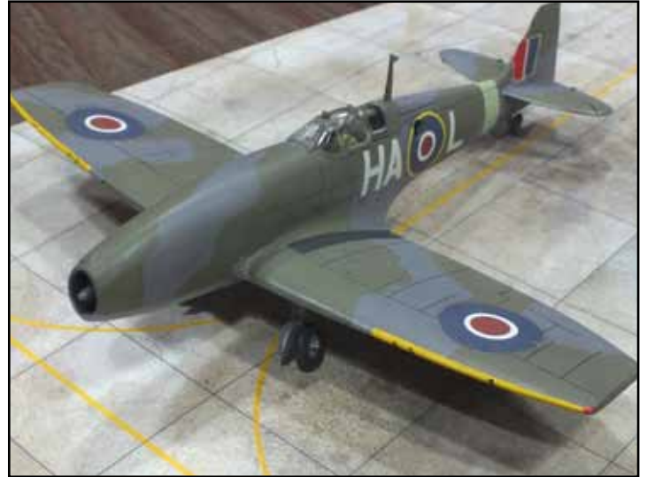
Above left and right: 1/72 Airfix plus 'stuff' - Supermarine Spitfire TRSO Jumo powered