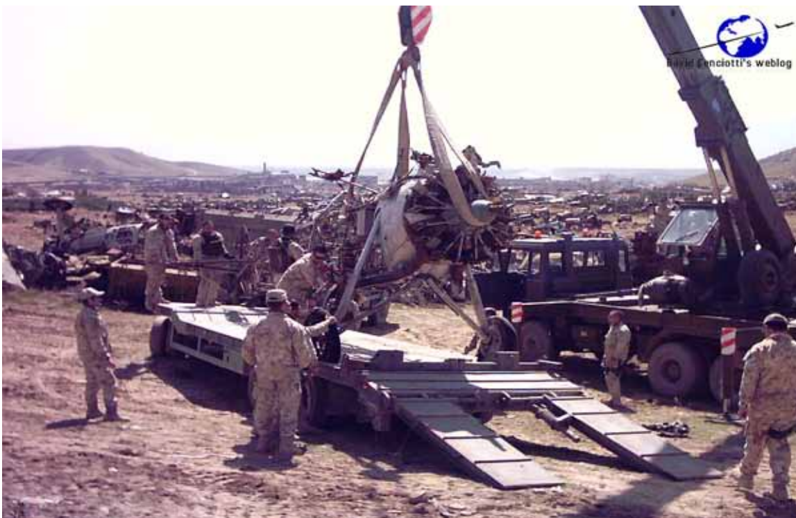
Left: IMAM Ro.37bis being recovered from a boneyard in Afghanistan, 2006