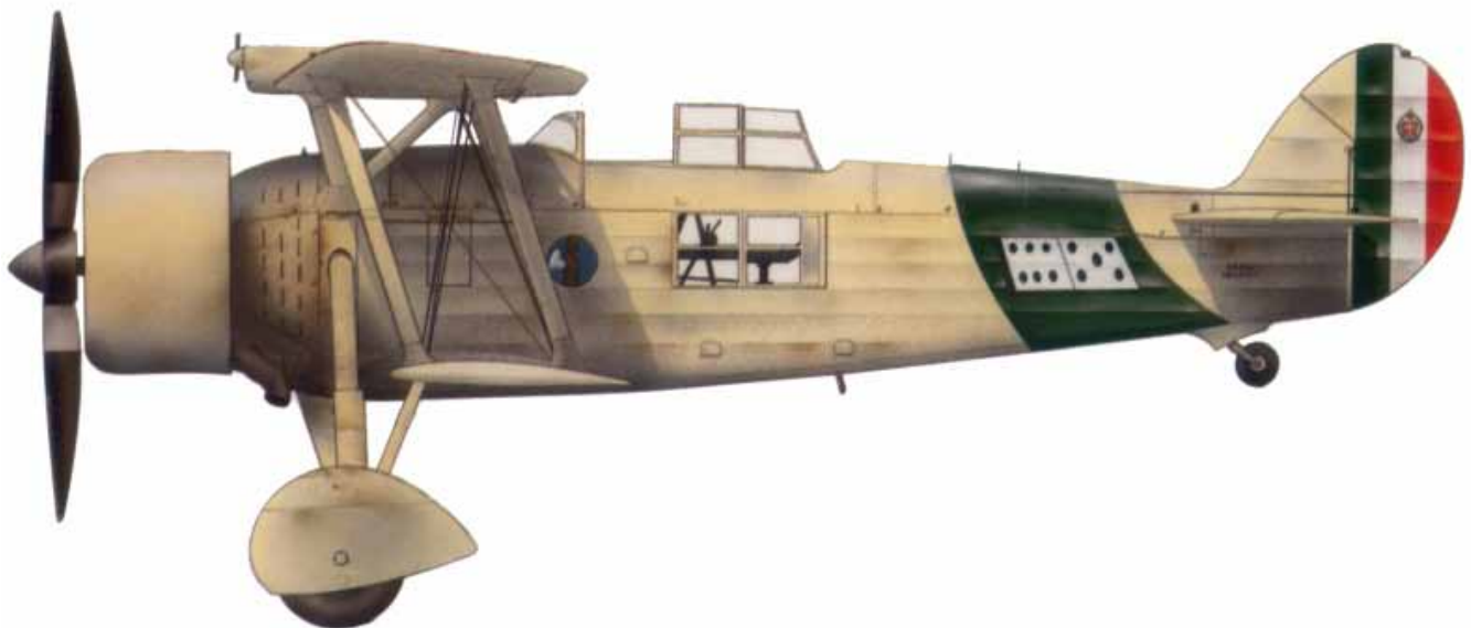
Above: IMAM Ro.37bis

The aircraft were popular with the RA and were also exported to Central