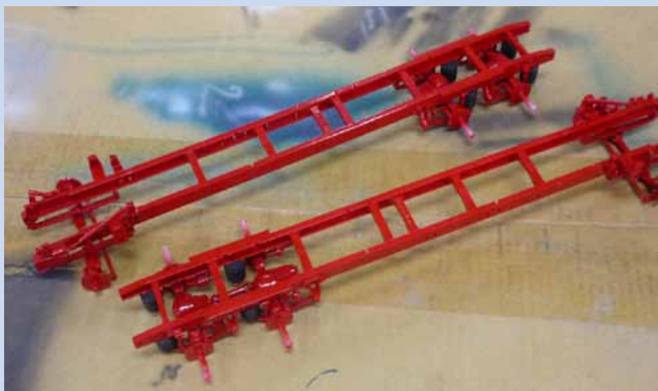
Above: the chassis of the truck