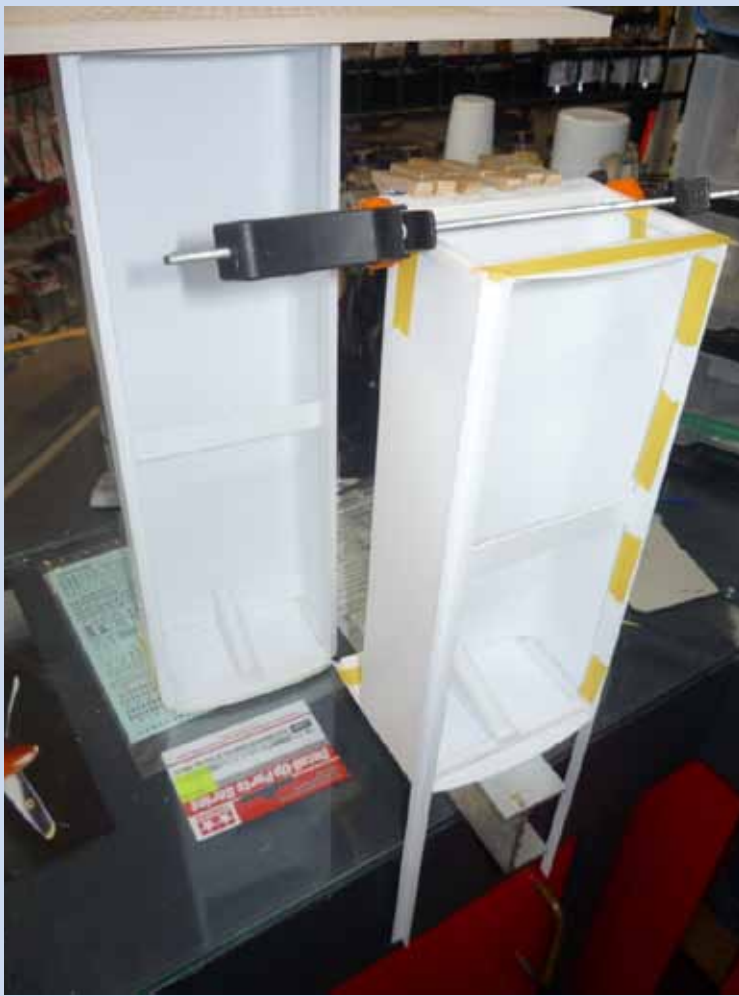
Left: the tipper bins under construction - completely scratch-built using card, beams and lots of clamps and weight.....