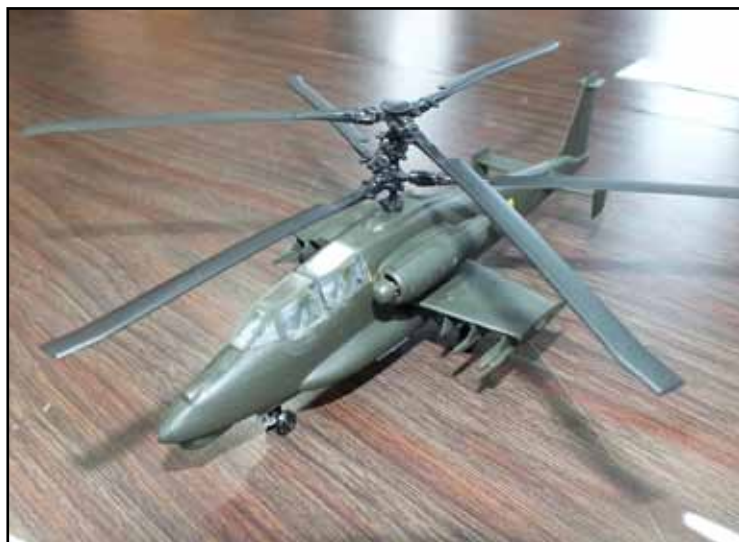
1/72 ESCI Kamov 'Hokum'