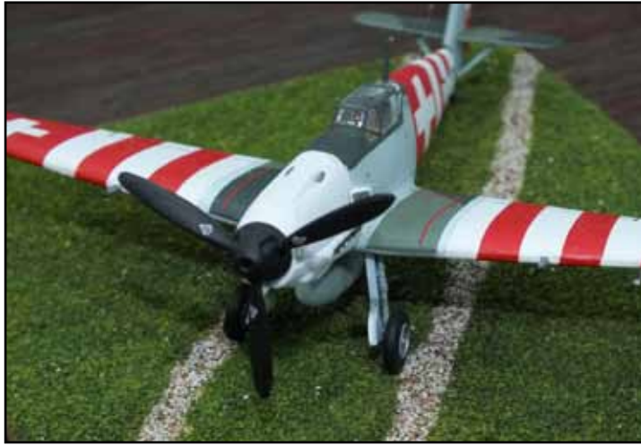
1/72 Airfix Messerschmitt Me 109G 'Swiss'