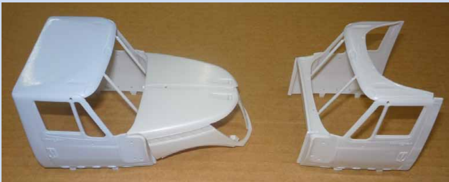
Above: the cab with the sleeper unit removed. The cab needed a new roof to cover the hole meant for the air deflector. Left-hand cab has been finished, right-hand cab still to do...