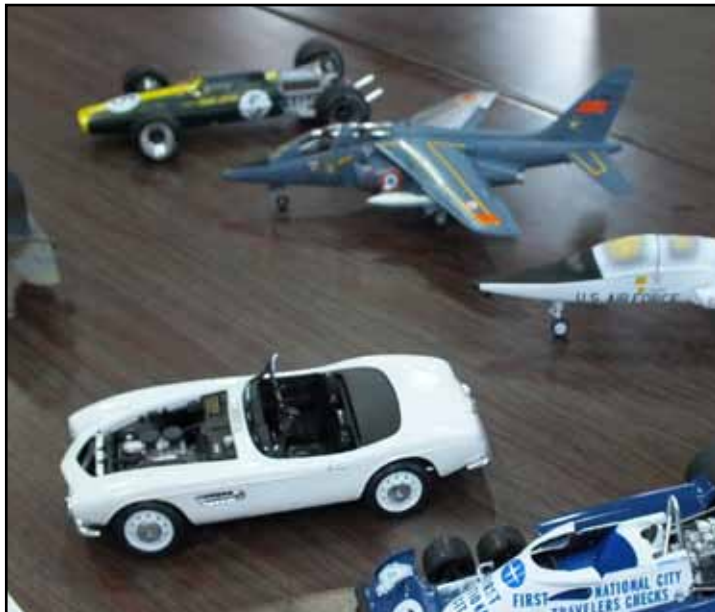
1/20 Ebbro Lotus 49, 1/48 Kinetic AlphaJet, 1/48 Wolfpack Designs Northrop T-38 Talon, 1/24 Revell BMW 507 & 1/48 Tamiya F-4U Corsair FAA - all in progress.....