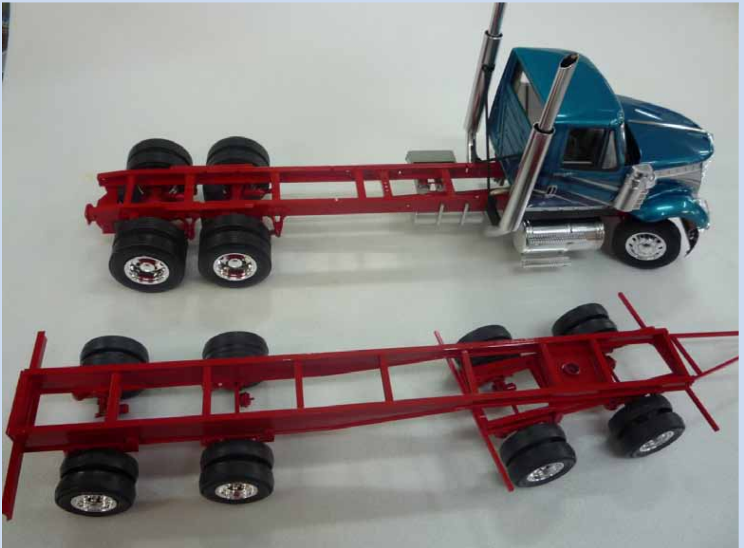
Above: awaiting the next phase - construction of the tipping bins....