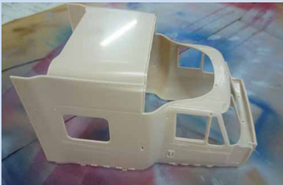
Above: the cab out of the box - the sleeper unit needs to be removed.