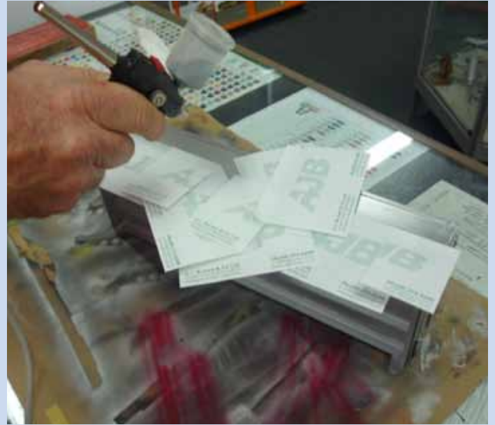
Below: the tipper bins get the Alclad treatment - primed, undercoated with gloss black and then a mixture of Alclad shades.