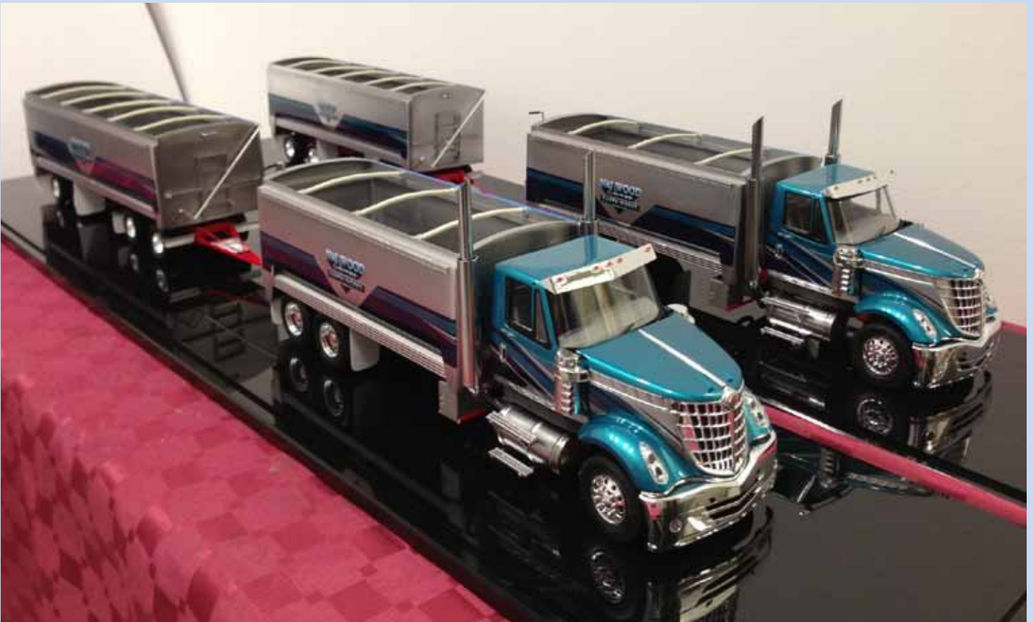
Above: the end result - both units modified, trailers and bins scratch-built, custom painted and graphics added, and finally mounted to their display bases.