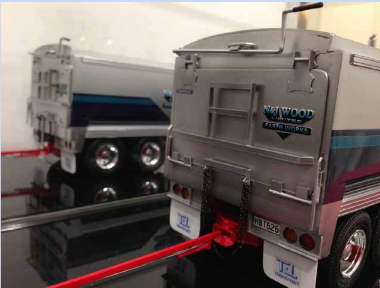
Above: graphics being applied including details such as the mudflap logos....