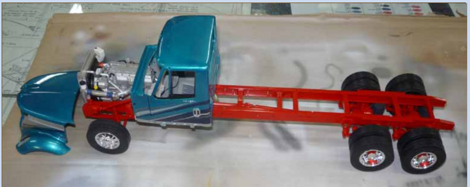
Above: trial fitting the almost-finished cab to the almost-finished chassis.