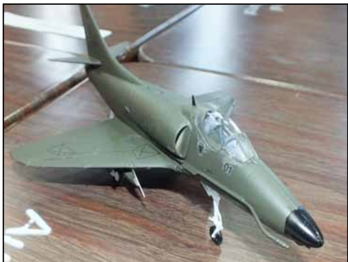
1/48 Italeri A-4K RNZAF Skyhawk - Vince Kelloway