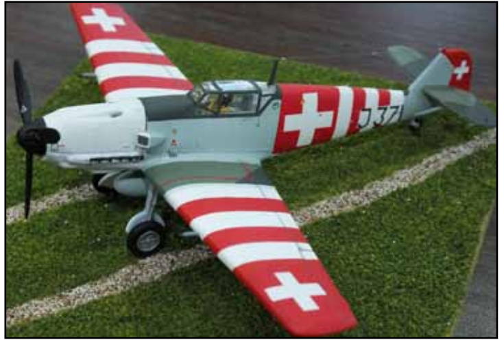
1/72 Airfix Messerschmitt Me 109G 'Swiss'