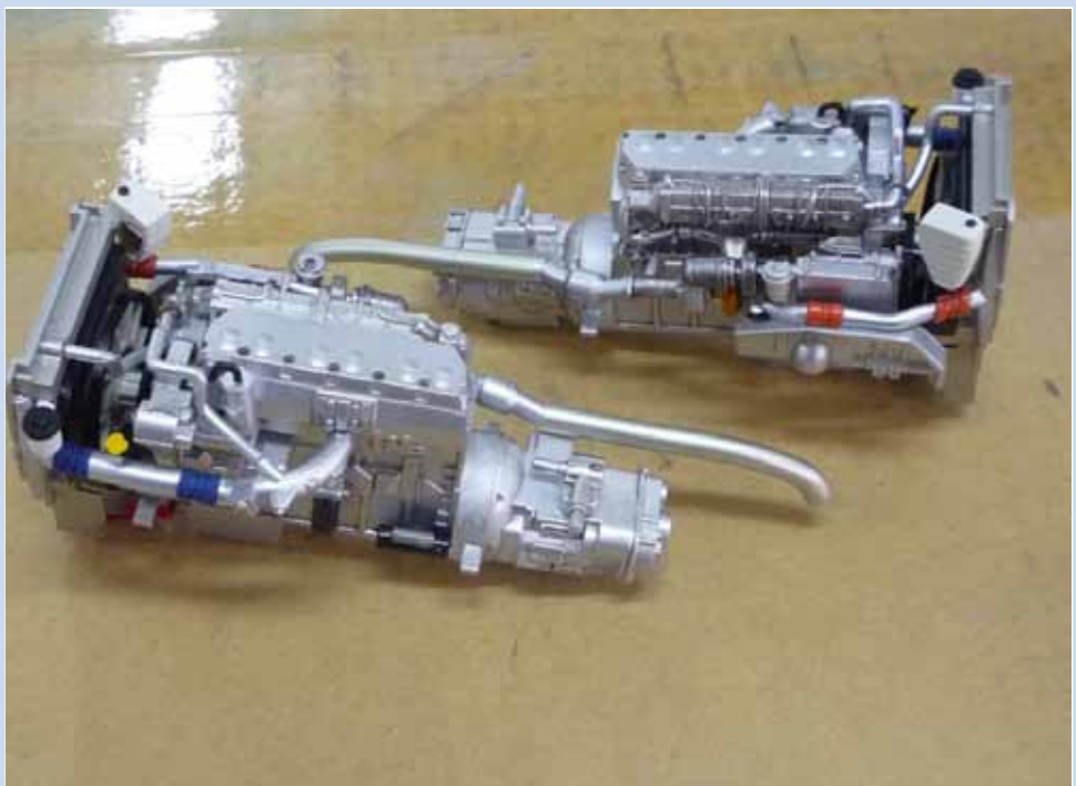
Above: work on the Cummins ISX15 engines begins