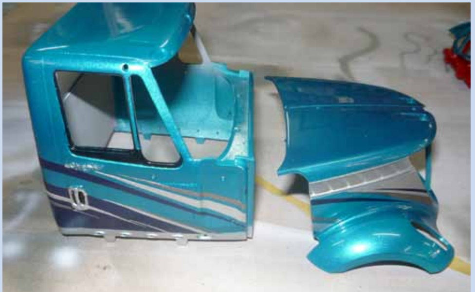
Above: painted using colour-matched paint. Graphics by Ron Van Dam