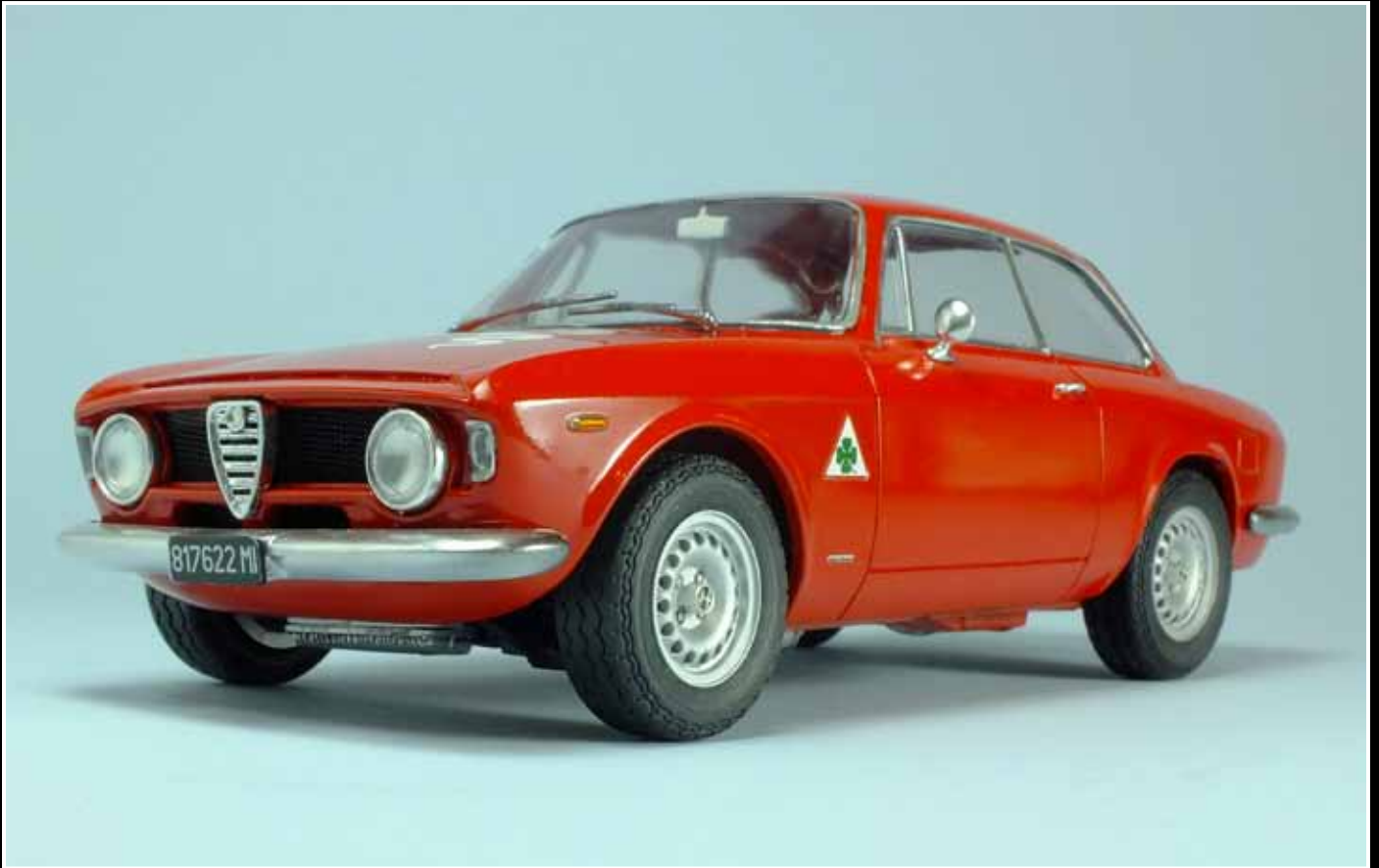
Above: 1/24 Tamiya Alfa Romeo Giulia Sprint GTA