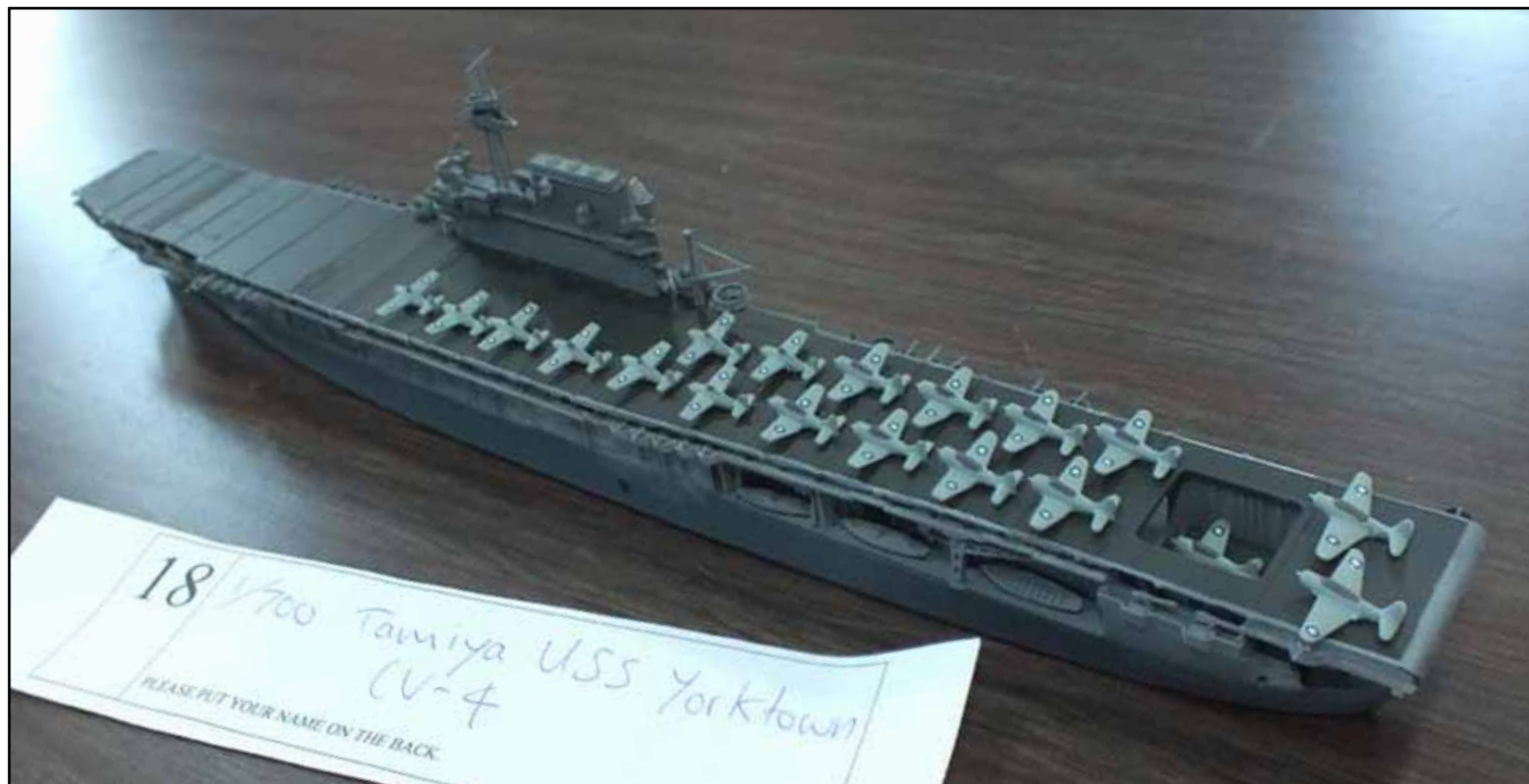
1/700 Tamiya USS Yorktown CV-4 - Vince Kellaway