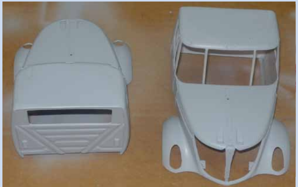
Above: cabs primed and ready for paint and graphics