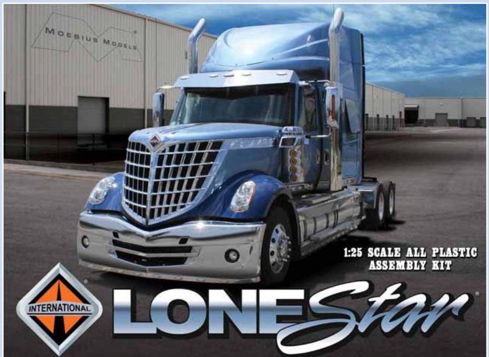
Above: Moebius1/25 International Lone Star

I won't go into all the nitty-gritty details of the build as the photo's can show you that, but suffice to say that as there is nothing in kit form to use for the "dumper bins" on both truck and trailers so all that had to be scratchbuilt! Incidentally the dumper bins were painted in one huge two day Alclad job! Also all the kit chrome parts were repainted in Alclad chrome.