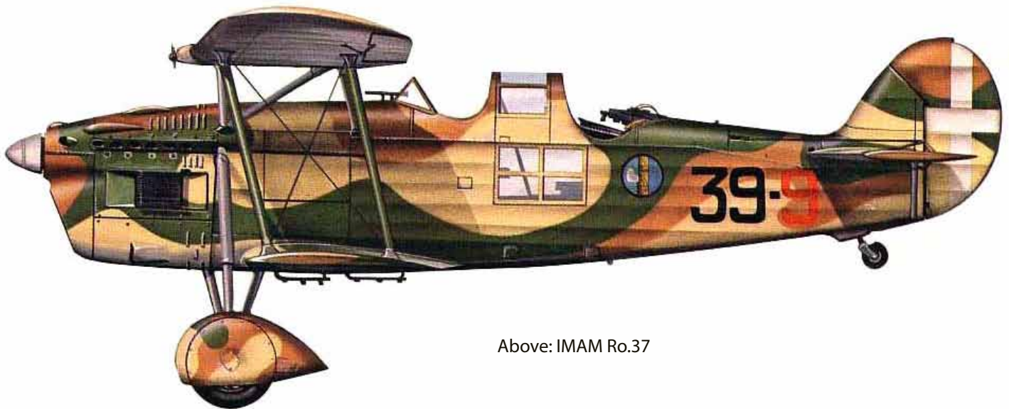
Above: IMAM Ro.37

commander and asked if the Americans would assist in recovering some Italian aircraft from a boneyard. Six Ro.37bis from the original 16 were recovered, some aircraft almost complete bar the fabric covering of the airframe. Some of the airframes had remnants of the original fabric including pieces that had been hidden from the weather and still had the original colours. One of the airframes is now at the Vigna di Valle Museum in Italy after having been restored. A restored Ro.43 is also on display.