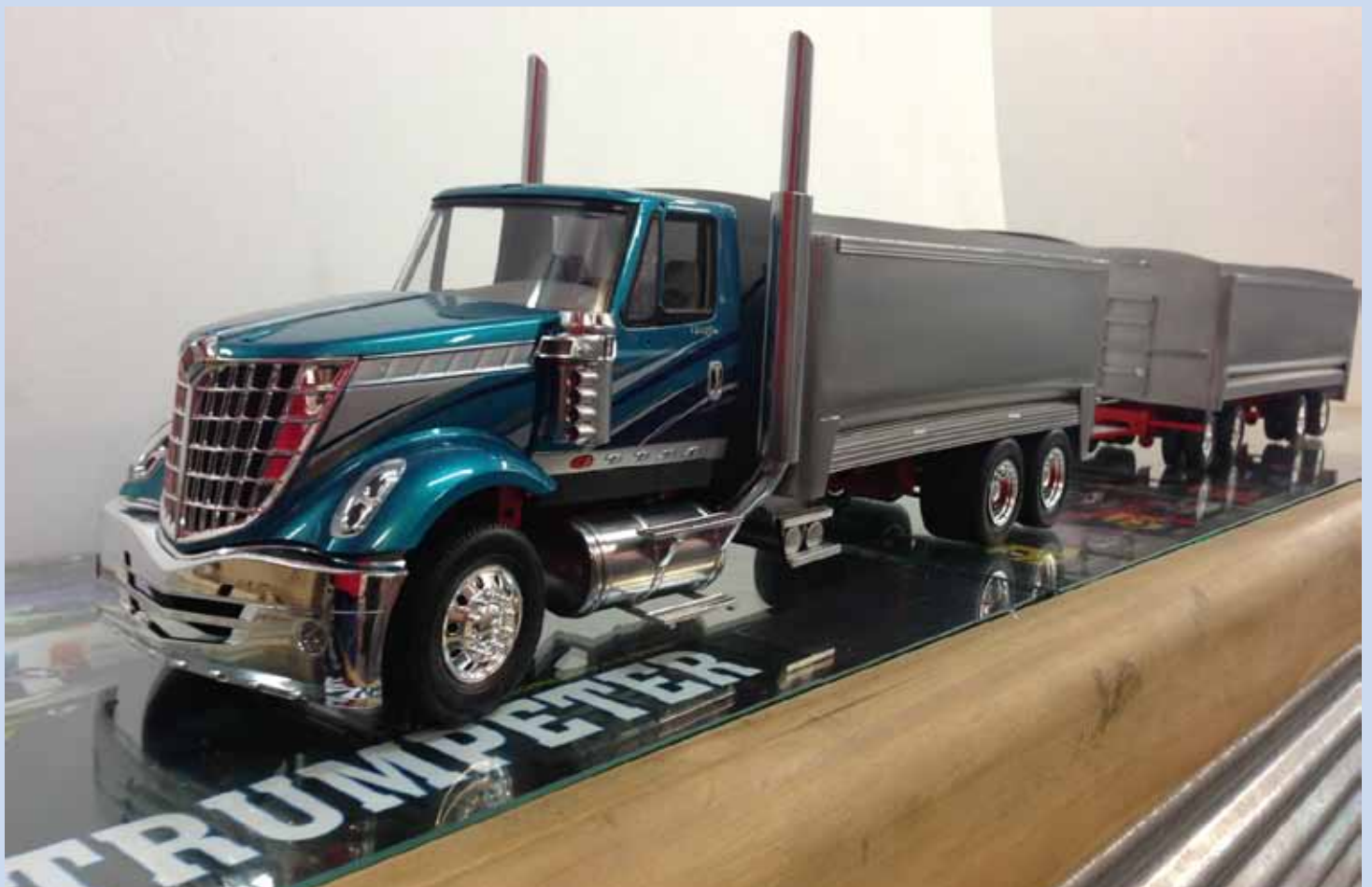
Above: finished units waiting for application of the company graphics.