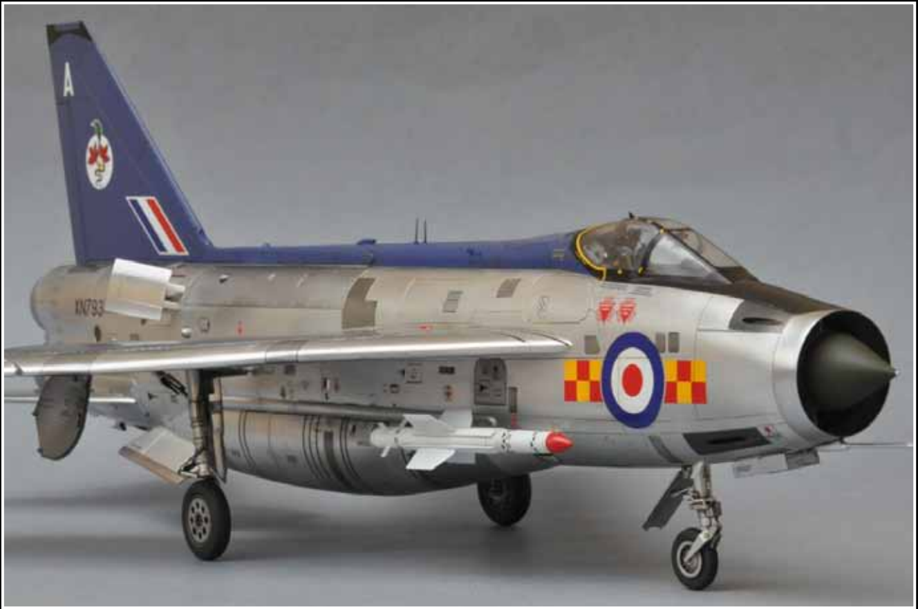
Above: 1/48 Airfix EE Lightning F.2A