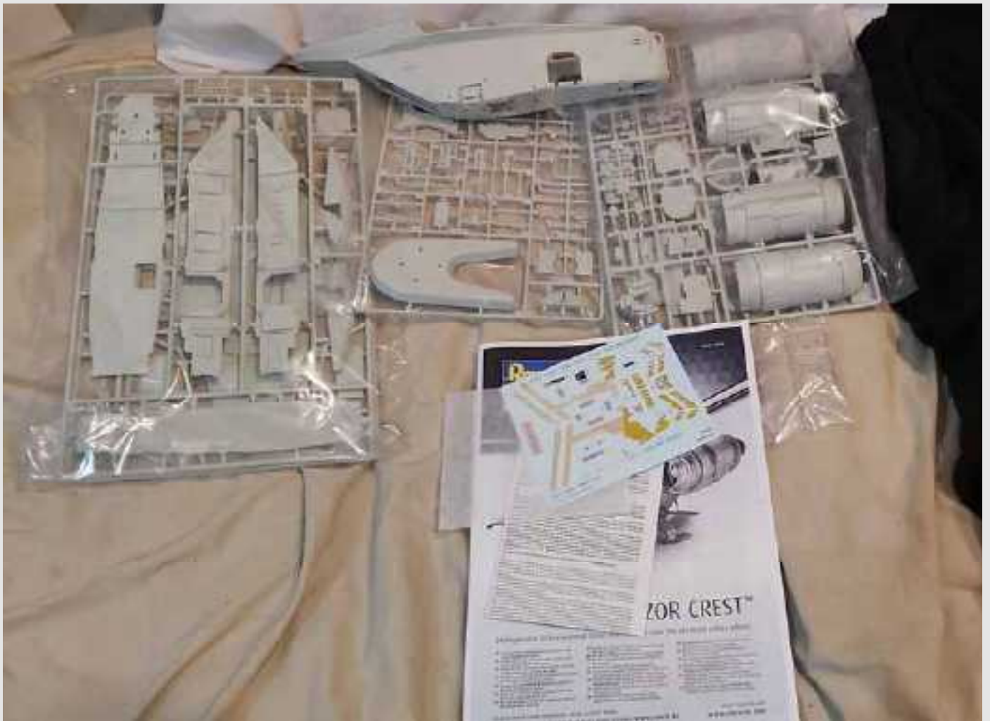
Pictures are worth a thousand words so here's a peek at the Instructions.