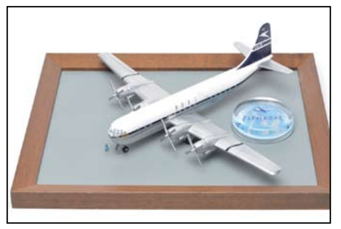
Pete's Minicraft Boeing 377 Stratocruiser 1-144-1