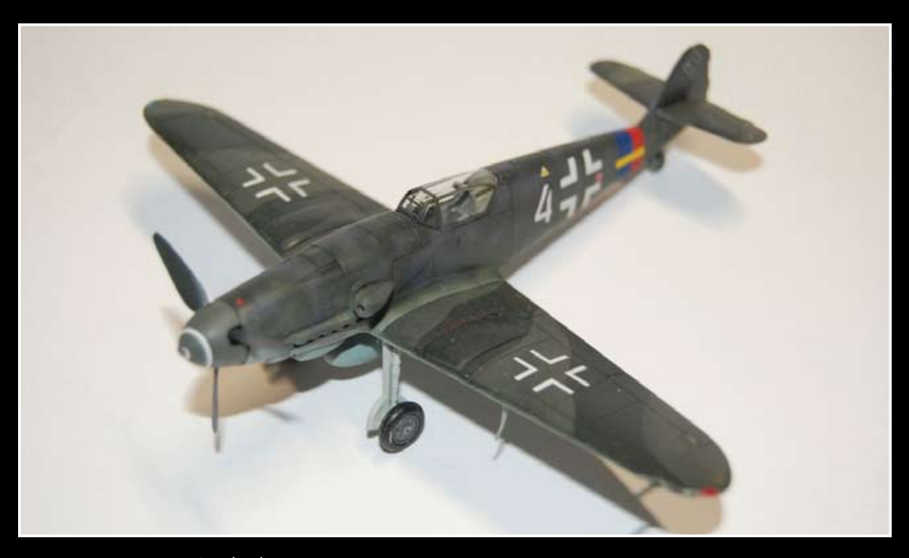
Sexy REVELL 109-G10 in 1/72 by Mike Rather