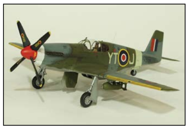
Barrie Flatman's Trumpeter 1-32 Mustang III