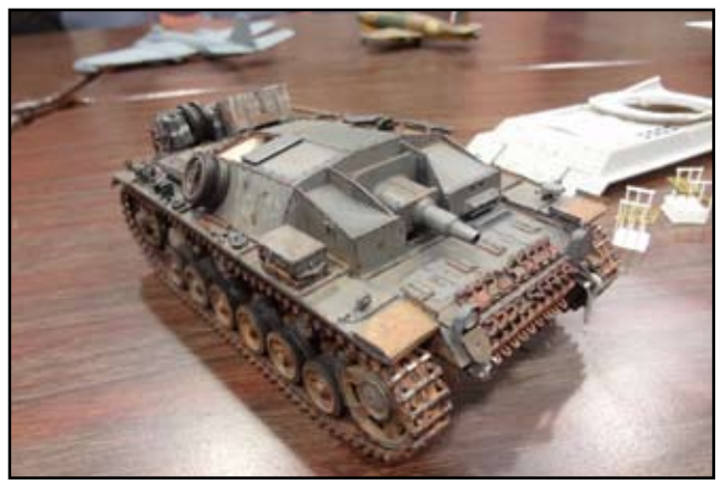
1/35 STUG by Gary Young