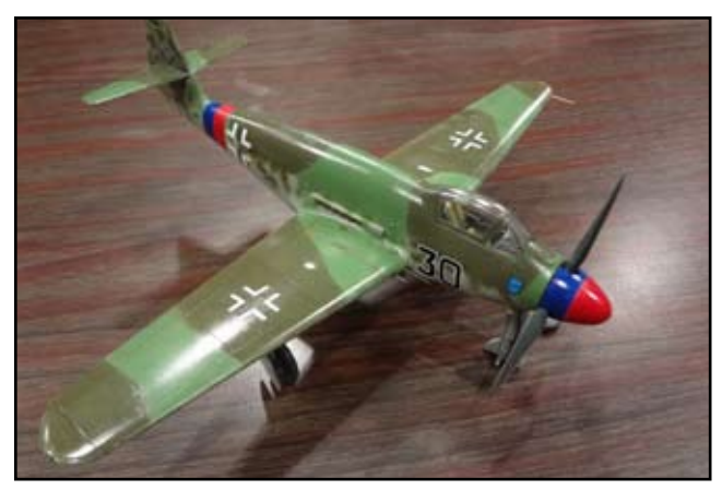
Trumpeter 1/48 Me509 by Brett Peacock