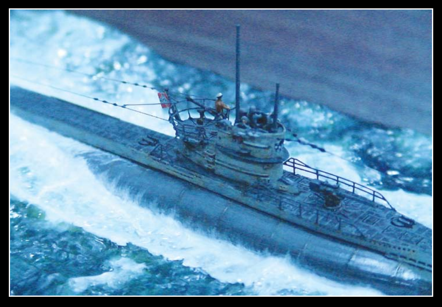
1/35 Beautiful U-Boat