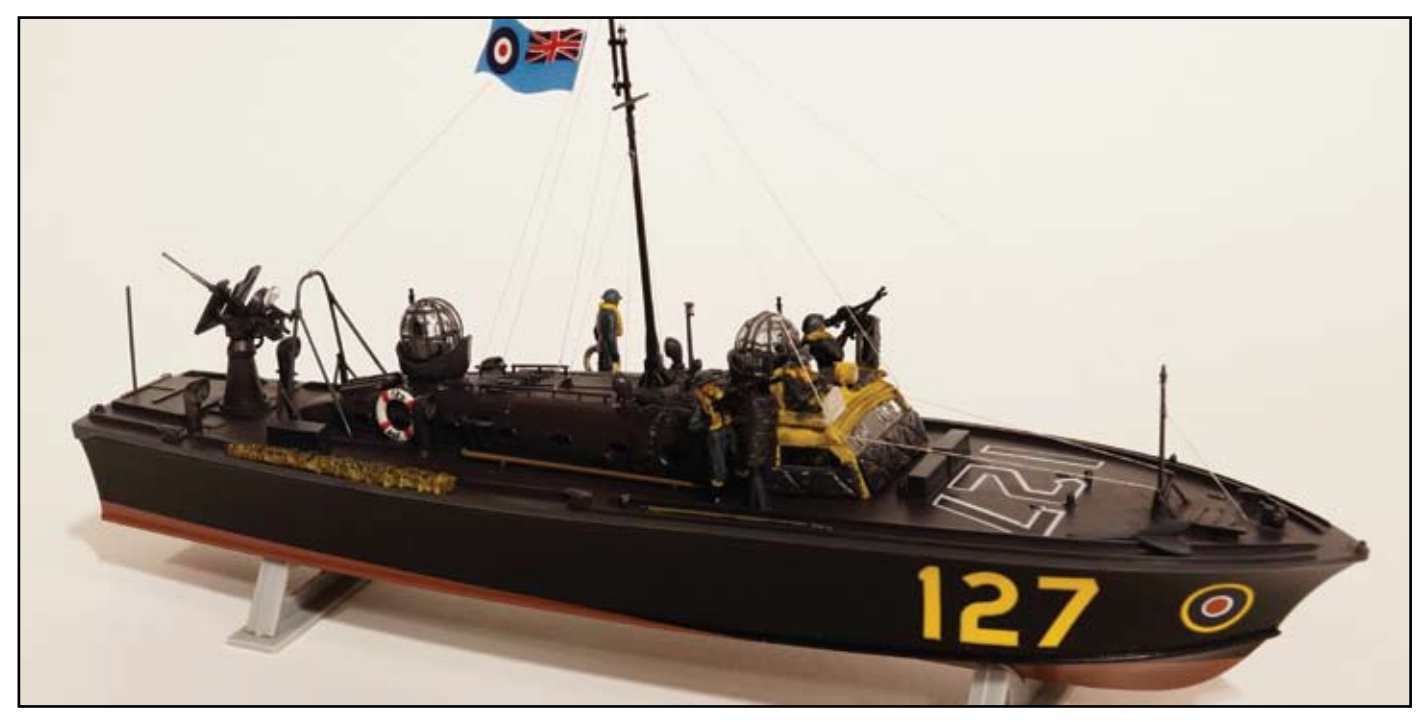
RAF Rescue Launch 1/72 by Peter Harrison