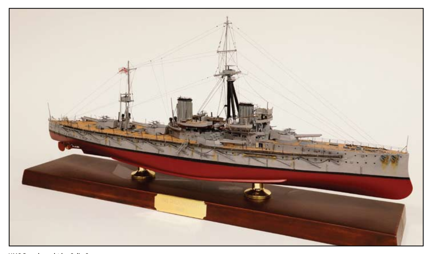
HMS Dreadnought