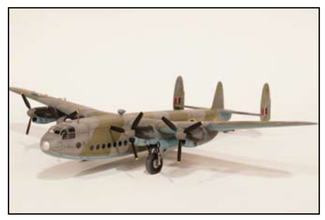
Avro York