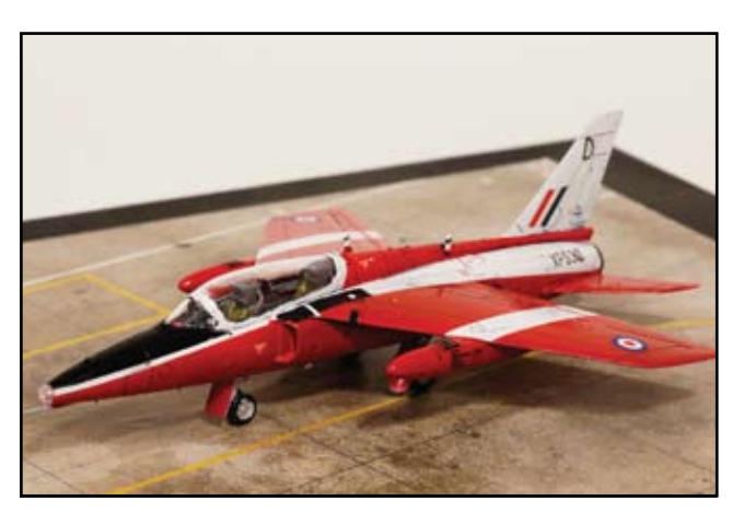
Folland Gnat 1/72 by Henry Ludlam