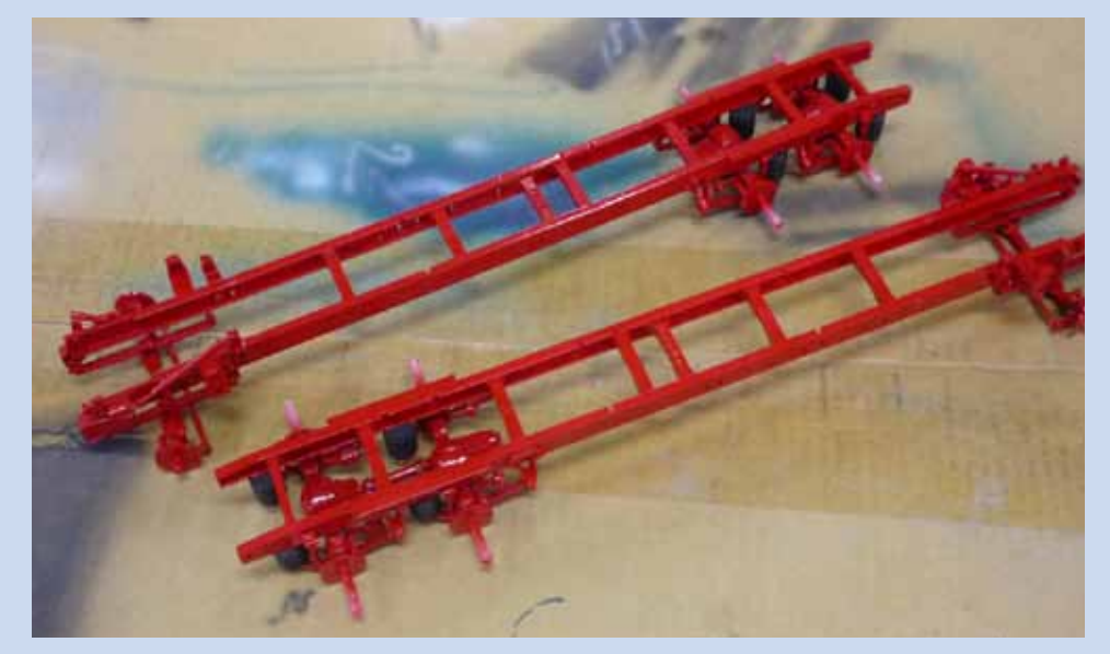
Above: the chassis of the truck