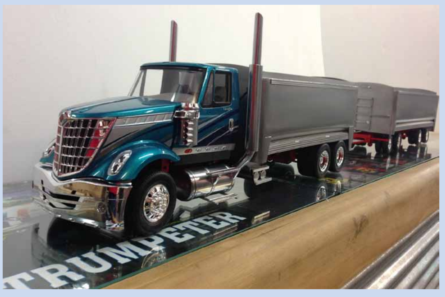
Above: finished units waiting for application of the company graphics.