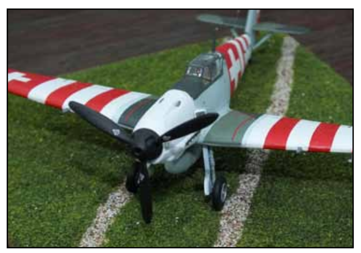
1/72 Airfix Messerschmitt Me 109G 'Swiss'