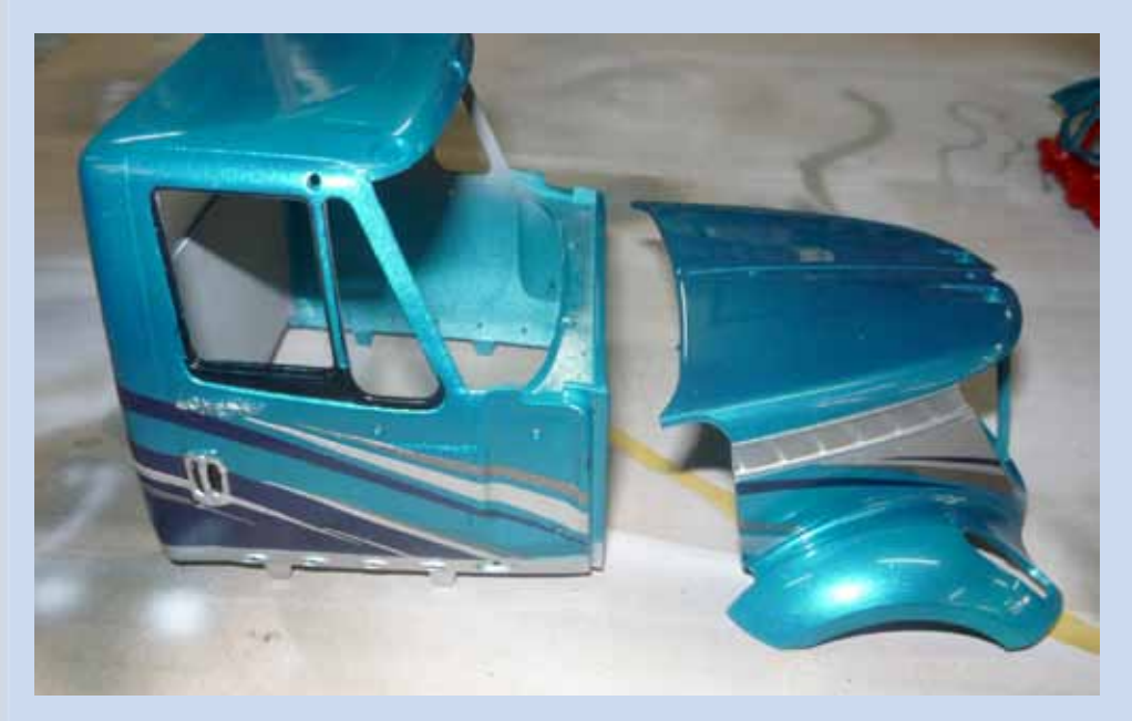
Above: painted using colour-matched paint. Graphics by Ron Van Dam