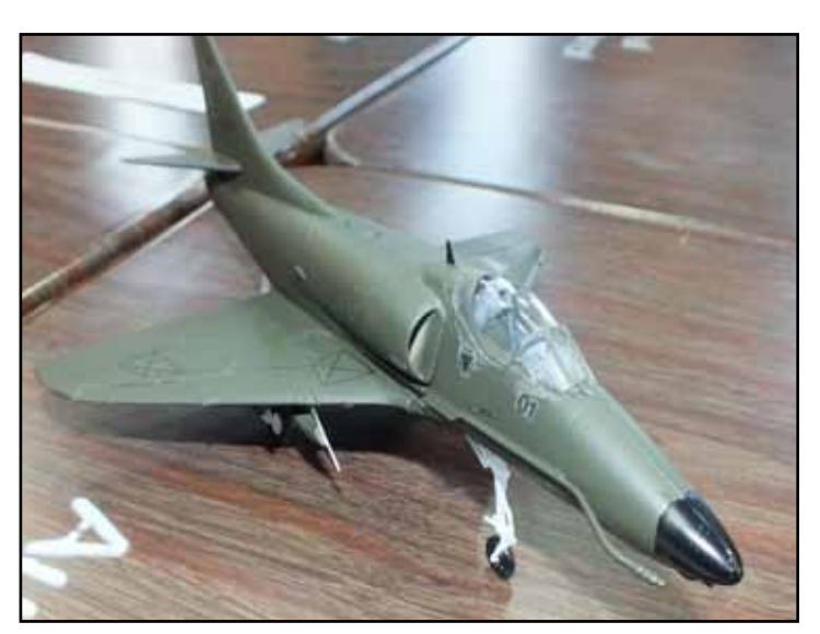
1/48 Italeri A-4K RNZAF Skyhawk - Vince Kelloway