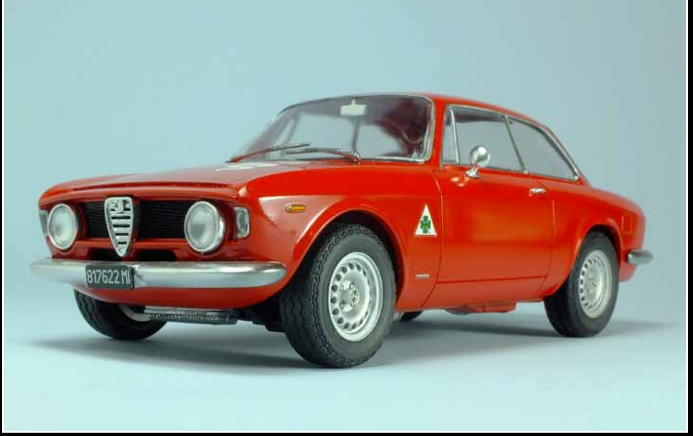
Above: 1/24 Tamiya Alfa Romeo Giulia Sprint GTA