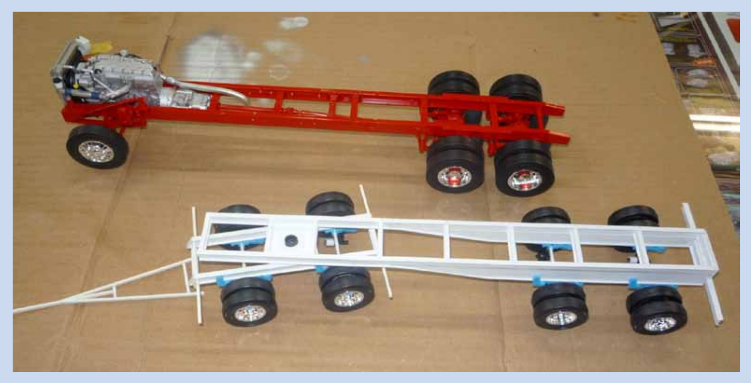
Above: scratch-built trailer unit ready for paint.