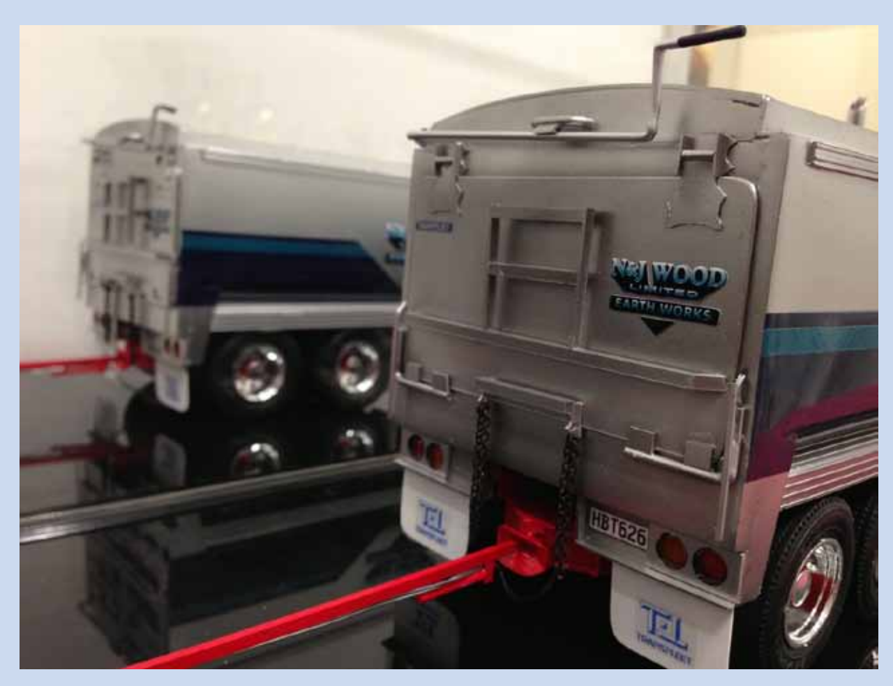
Above: graphics being applied including details such as the mudflap logos....