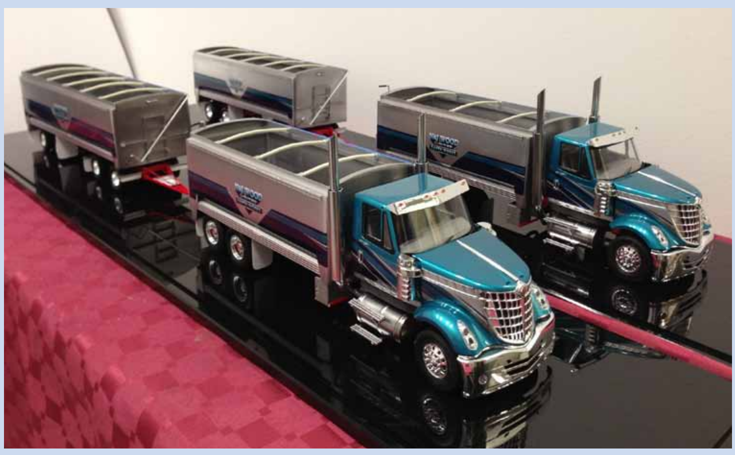
Above: the end result - both units modified, trailers and bins scratch-built, custom painted and graphics added, and finally mounted to their display bases.