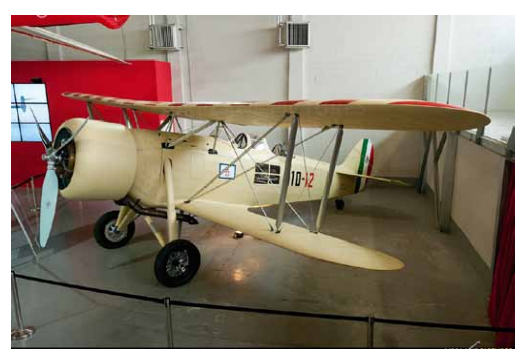
Above: one of the salvaged Afghani Ro.37bis restored and on display at Vigna de Valle Museum, Italy.