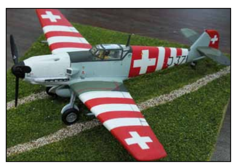
1/72 Airfix Messerschmitt Me 109G 'Swiss'