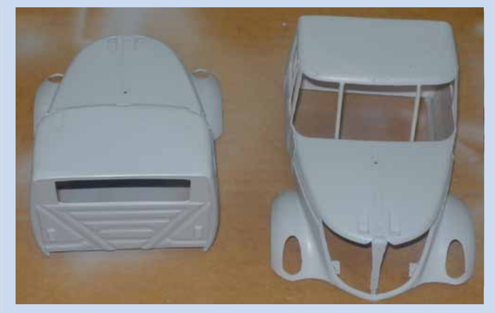
Above: cabs primed and ready for paint and graphics