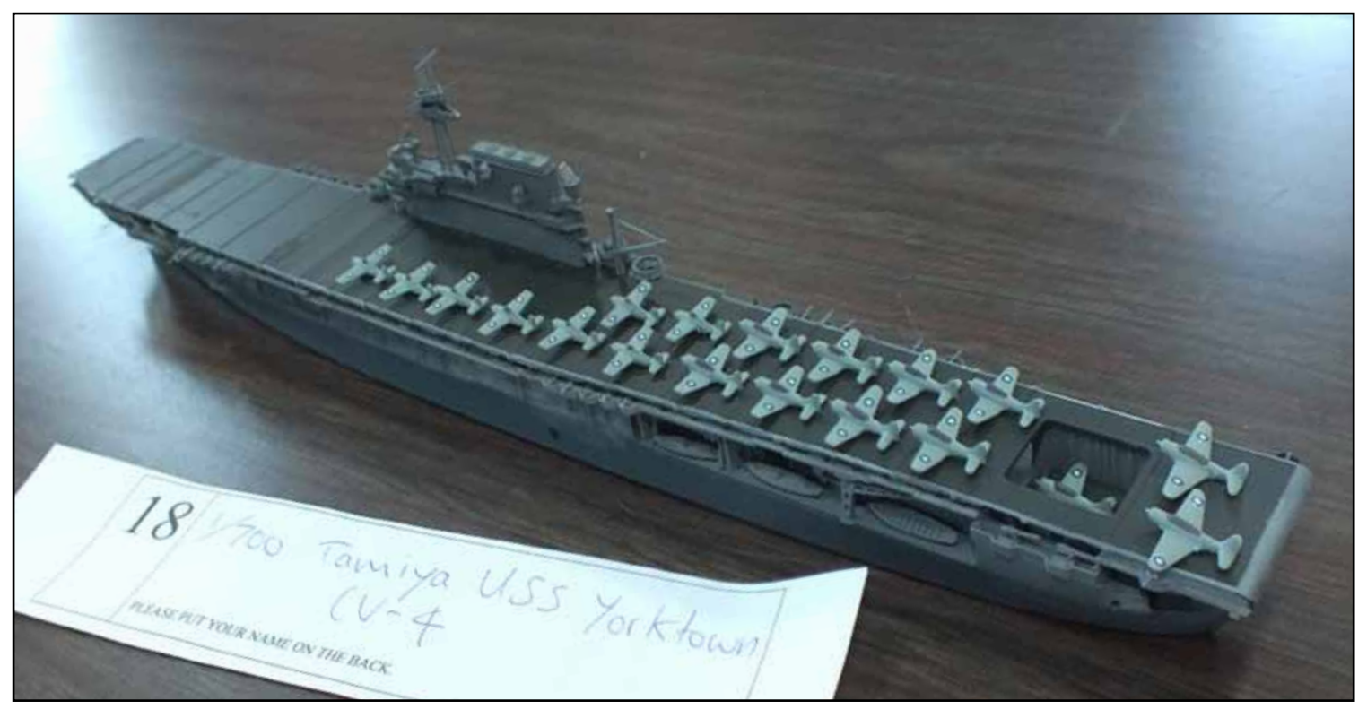
1/700 Tamiya USS Yorktown CV-4 - Vince Kellaway