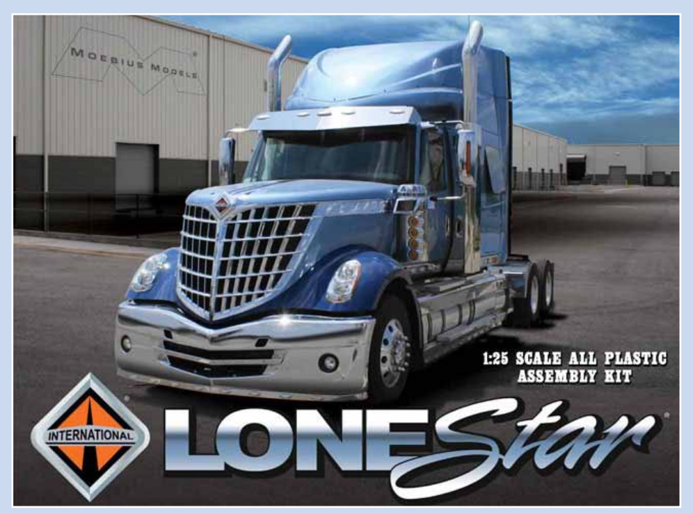
Above: Moebius1/25 International Lone Star

I won't go into all the nitty-gritty details of the build as the photo's can show you that, but suffice to say that as there is nothing in kit form to use for the "dumper bins" on both truck and trailers so all that had to be scratchbuilt! Incidentally the dumper bins were painted in one huge two day Alclading job! Also all the kit chrome parts were repainted in Alclad chrome.