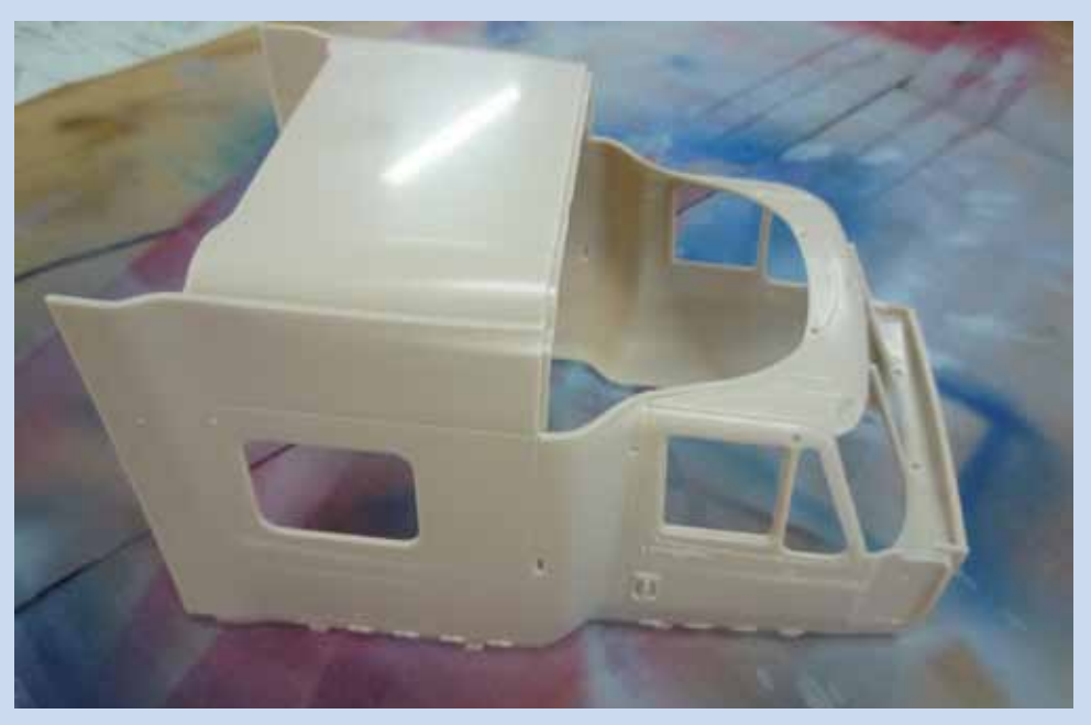
Above: the cab out of the box - the sleeper unit needs to be removed.