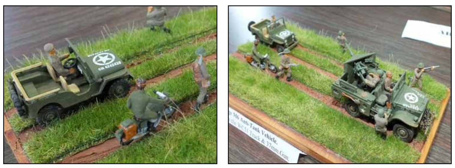
1/72 Italeri Dodge WC 51 Gun Platform and Airfix Willys G P 4 x 4 Jeep