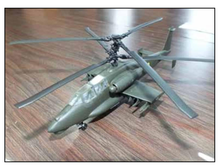
1/72 ESCI Kamov 'Hokum'