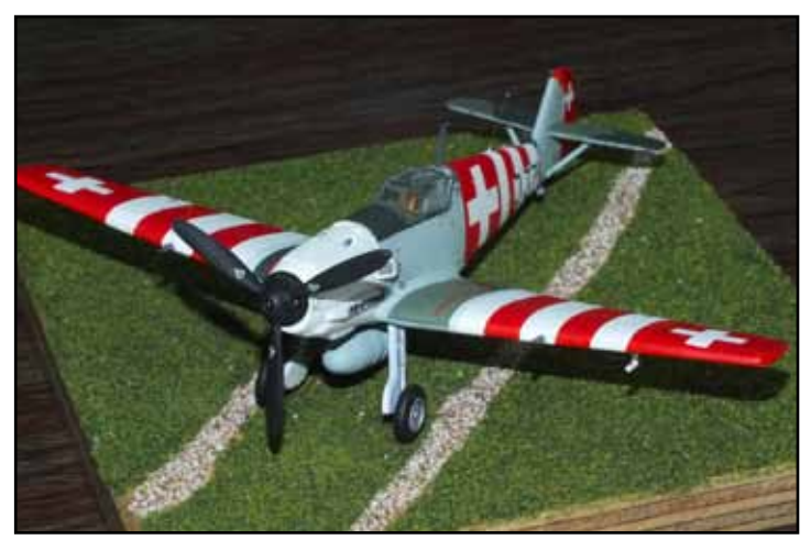
1/72 Airfix Messerchmitt Bf-109 Swiss Air Force by John Watkins