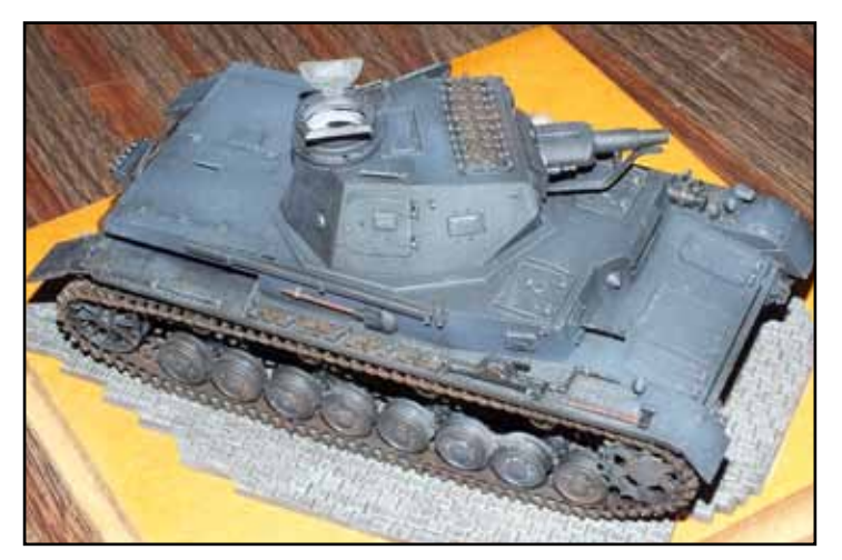
1/35 Panzer D4 by Sean Ford