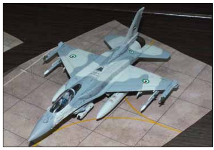
1/72 Hasegawa F-16E United Arab Emirates by Henry Ludlam