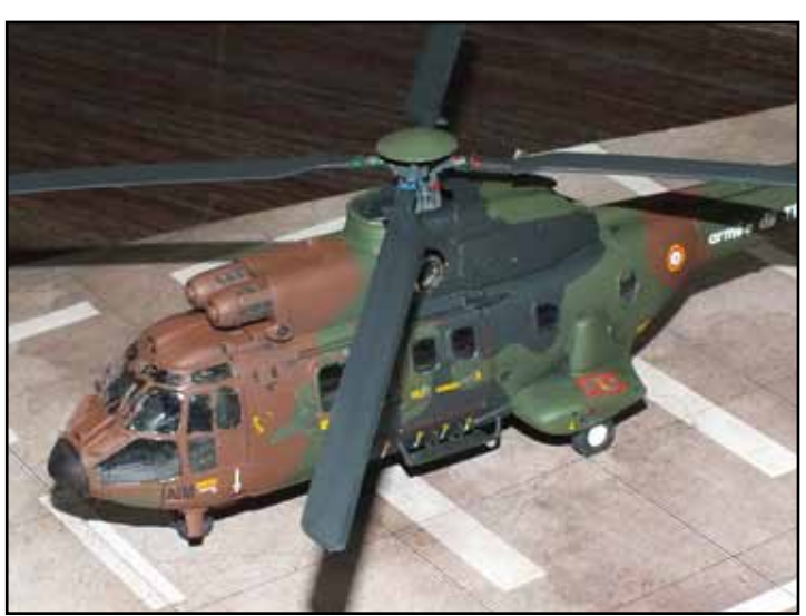
1/72 Italeri Super Puma Armee De Terre by Henry Ludlam