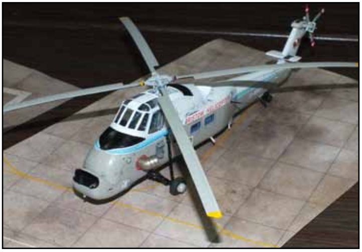
1/72 Italeri Westland Wessex Mk60 "Bristow Helicopters" by Henry Ludlam