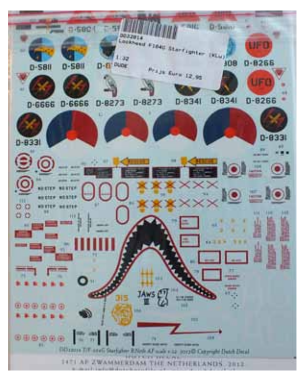
Above - Dutch Decals RNethAF decal set with markings for 3 single seat F-104's and a TF-104 two-seat trainer.

Right - The clear parts will be a challenge to restore.