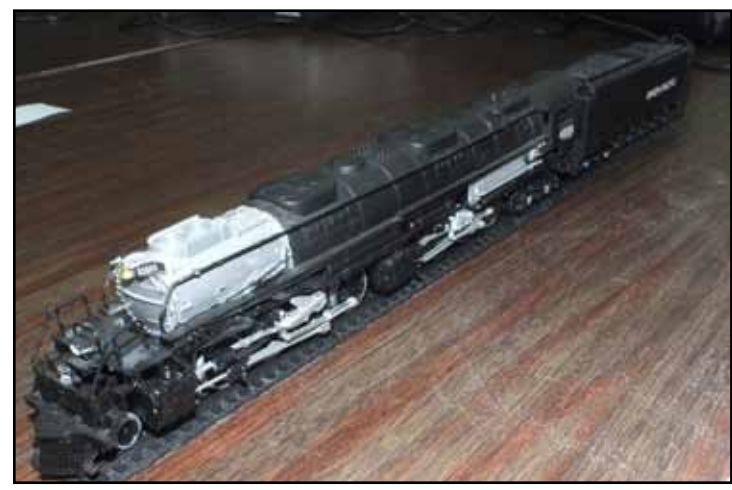
1/87 Revell Big Boy Locomotive by Vince Kelleway