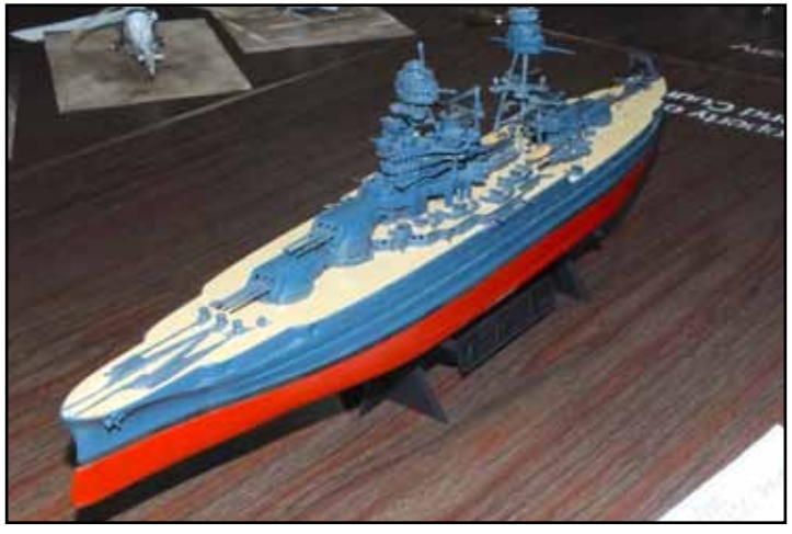
1/350 Hobby Boss USS Arizona by Vince Kelleway