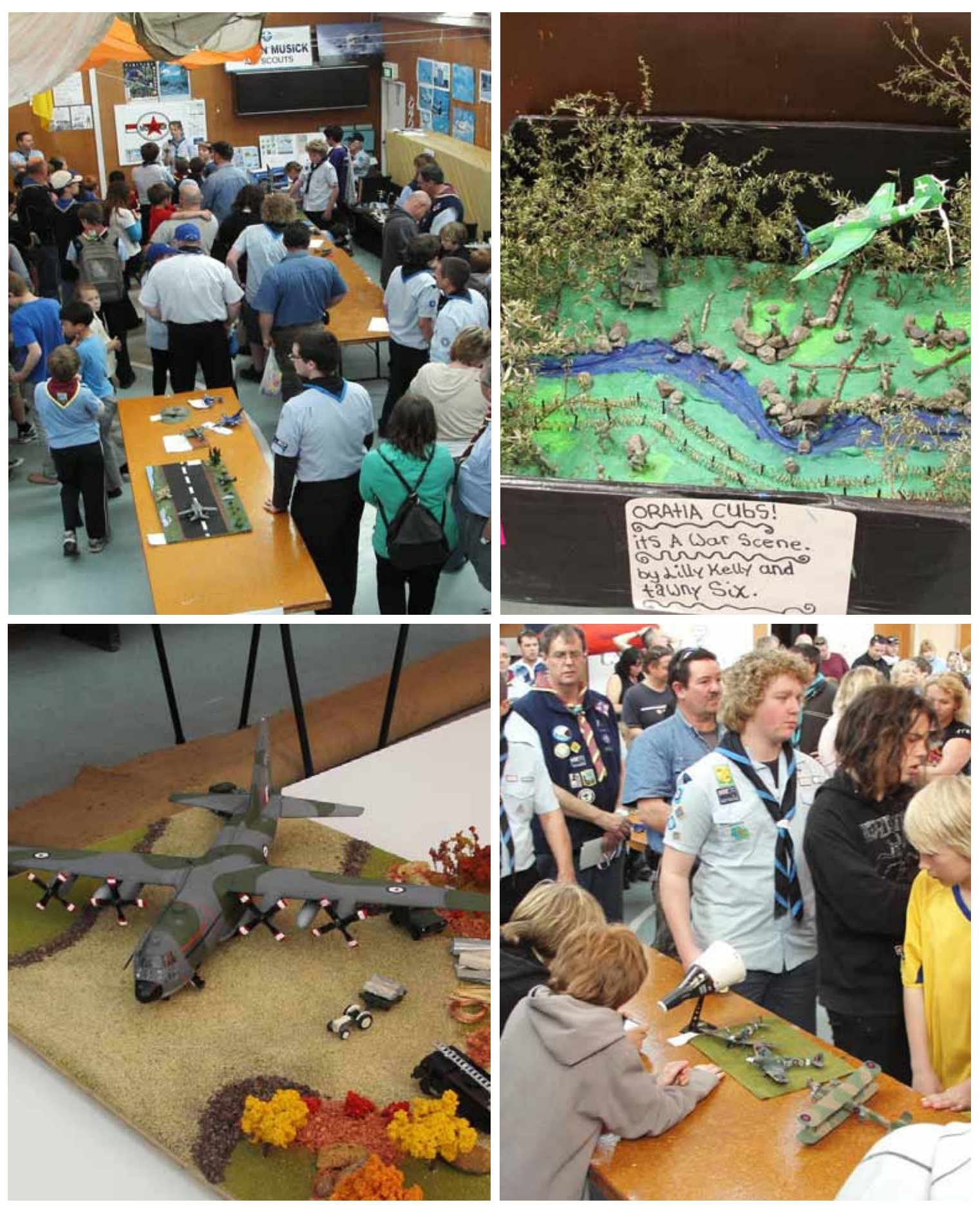
See Modelairs Facebook page for more images.