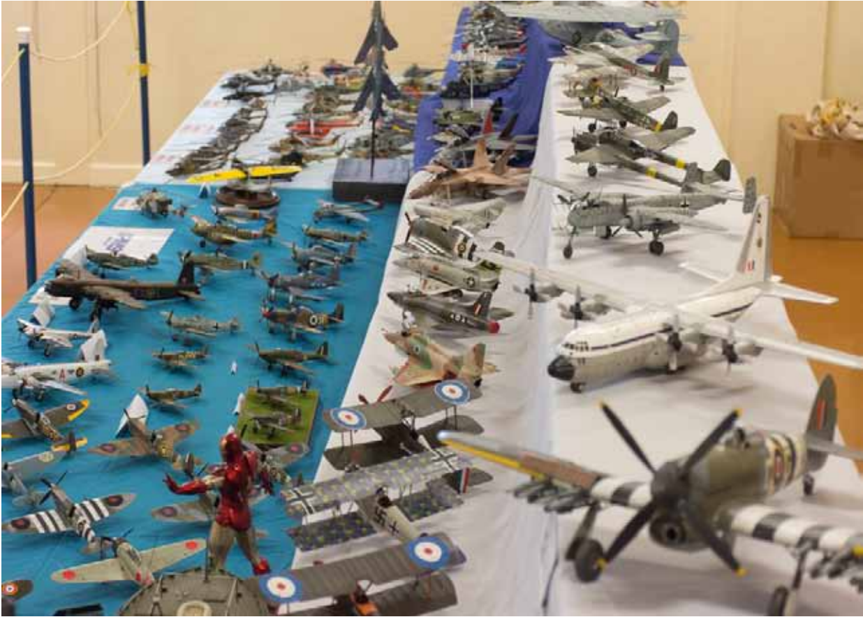
Above: some of the models on display