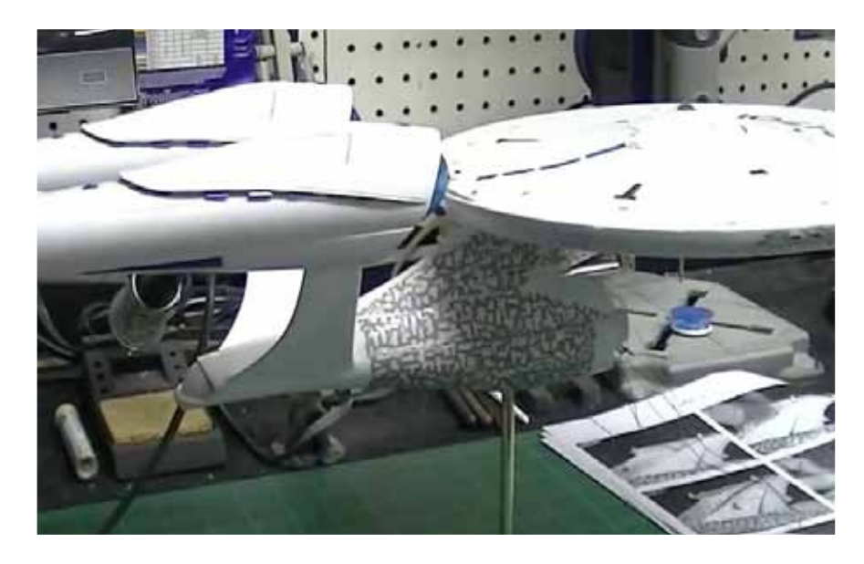
Above and below: an example of the masking in progress