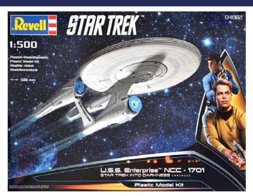
Above: the Revell kit released in 2013

However that came to nothing. So step up Aztec Dummy - a company that makes masks for various sci-fi topics, particularly Star Trek subjects. The most common mask being.... Aztec pattern!