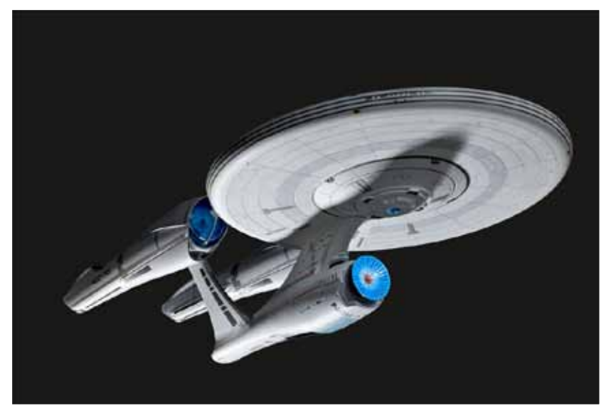
Above: the kit built out of the box