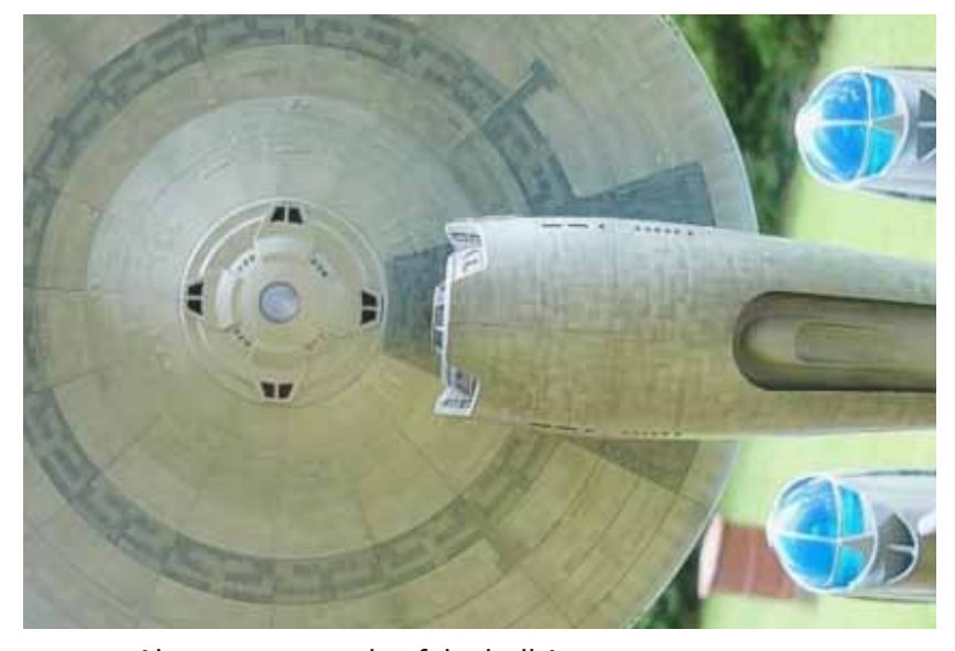
Above: an example of the hull Aztec pattern